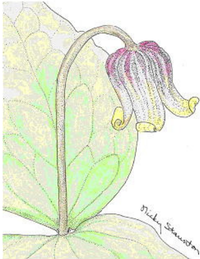
Curlyheads ( Clematis ochroleuca )

PIEDMONT CHAPTER VIRGINIA NATIVE PLANT SOCIETY P.O. BOX 336 THE PLAINS, VA 20198