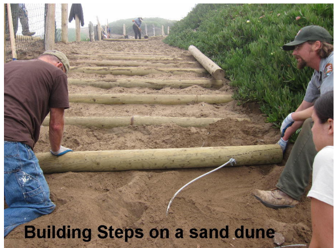
Building Steps on a sand dune

This work corroborated our justification for trail work at home. While the trail itself destroys habitat, if we can keep people on the trail, they won't be trampling the rest of the habitat. And this is a prime objective of VNPS: save habitat.