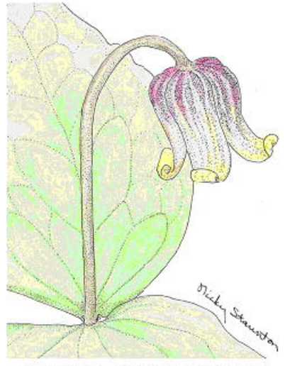
Curlyheads (Clematis ochroleuca)