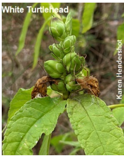
(continued on page 2)

The field also offered some interesting comparisons. Most of us are familiar with invasive Chinese Bush-clover ( Lespedeza cuneata ), with its leaflets widest at the tip. At Clifton it grows close to the native Slender Bush-clover ( L. virginica ), with leaflets widest near the middle. (See page 8 for leaf comparisons.) We also saw scarlet leaves of both Smooth Sumac ( Rhus glabra ) and Winged or Shining Sumac ( R. copallinum ). The former had dense compact, bright red drupes,