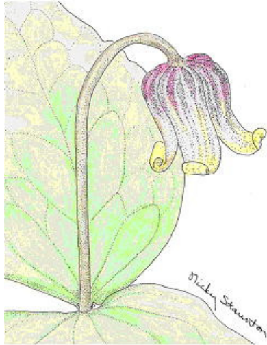
Curlyheads ( Clematis ochroleuca )

PIEDMONT CHAPTER VIRGINIA NATIVE PLANT SOCIETY P.O. BOX 336 THE PLAINS, VA 20198