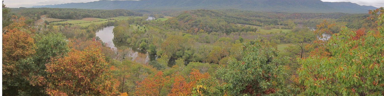
View from Cullers Overlook in Shenandoah River State Park

Directions: Shenandoah River State Park is 8 miles south of Front Royal on US-340. Follow Daughter of the Stars Drive to the dead end and turn left. Go to the last parking lot near Shelter 1, where we will meet. Park entrance fee is $7.