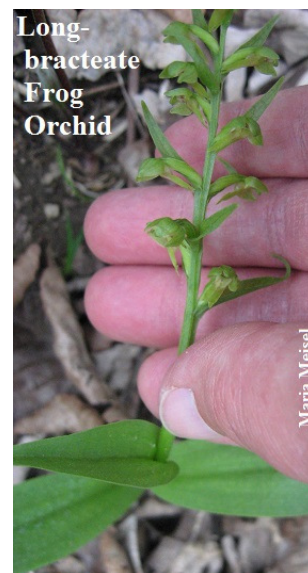
Long-bracteate Frog Orchid

Wildflower fans are die-hards, however, and we had a good turnout in spite of the adverse weather. About 300 visitors participated in programs and hikes on May 6 and 7. Wildflowers were at their peak, so hikers were treated to interesting discoveries such as Purple Clematis ( C. occidentalis ), Moss Phlox ( P. subulata ), Birdfoot Violet ( Viola pedata ), Yellow Lady's Slipper ( Cypripedium parviflorum ), Showy Orchis ( Galearis spectabilis ), Wild Geranium ( G. maculatum ), Yellow Pimpernel ( Taenidia integerrima ), Wood Anemone ( A. quinquefolia ) and lots of Large-Flowered Trillium ( T. grandiflorum ). Long-bracteate Frog Orchids ( Coeloglossum viride ) in the Crescent Rock Overlook parking lot were a highlight.