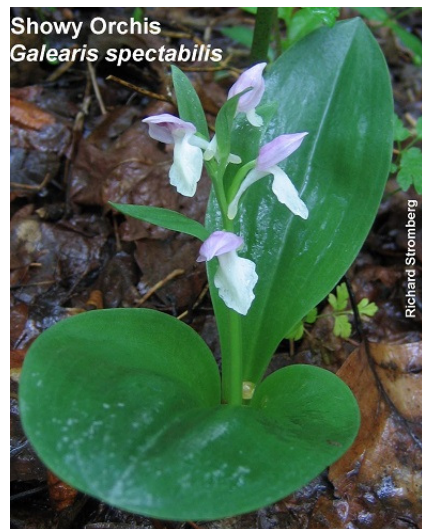
Showy Orchis Galearis spectabilis