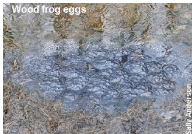
Wood frog eggs