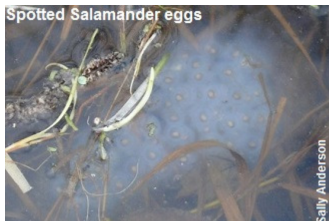
Spotted Salamander eggs