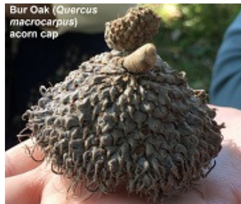
Bur Oak ( Quercus macrocarpus ) acorn cap