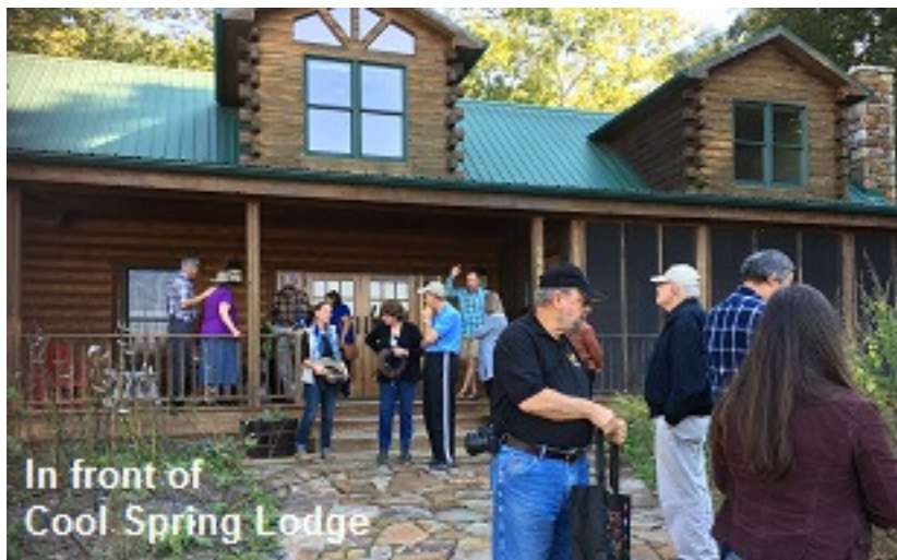
In front of Cool Spring Lodge

We had a wonderful group of about 40 people attend. This year for the first time we invited non-members. Gathering at noon for a potluck lunch, social hour, and native plant seed exchange, we enjoyed a wide variety of delicious food. The seed exchange was met with enthusiasm and lots of good discussion.