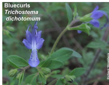
Bluecurls Trichostema dichotomum

We met the owners of part of this prairie, and they are excited about their property and were kind enough to provide parking and cold drinks for which we thank them. This is a place we hope to visit regularly.