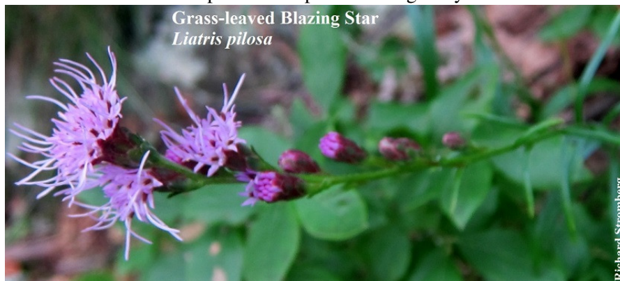
Grass-leaved Blazing Star Liatris pilosa