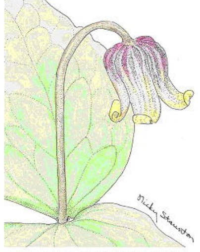
Curlyheads (Clematis ochroleuca)

PIEDMONT CHAPTER VIRGINIA NATIVE PLANT SOCIETY P.O. BOX 336 THE PLAINS, VA 20198