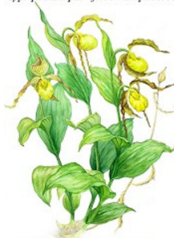
watercolor with color pencil by Elena Maza Borkland