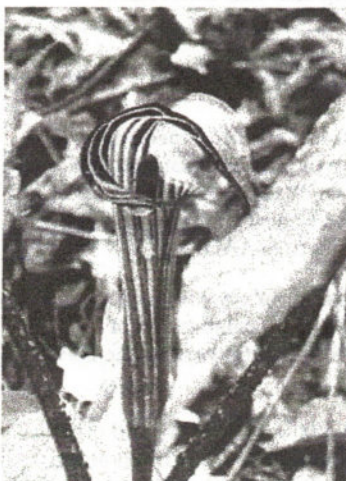
Jack in the Pulpit