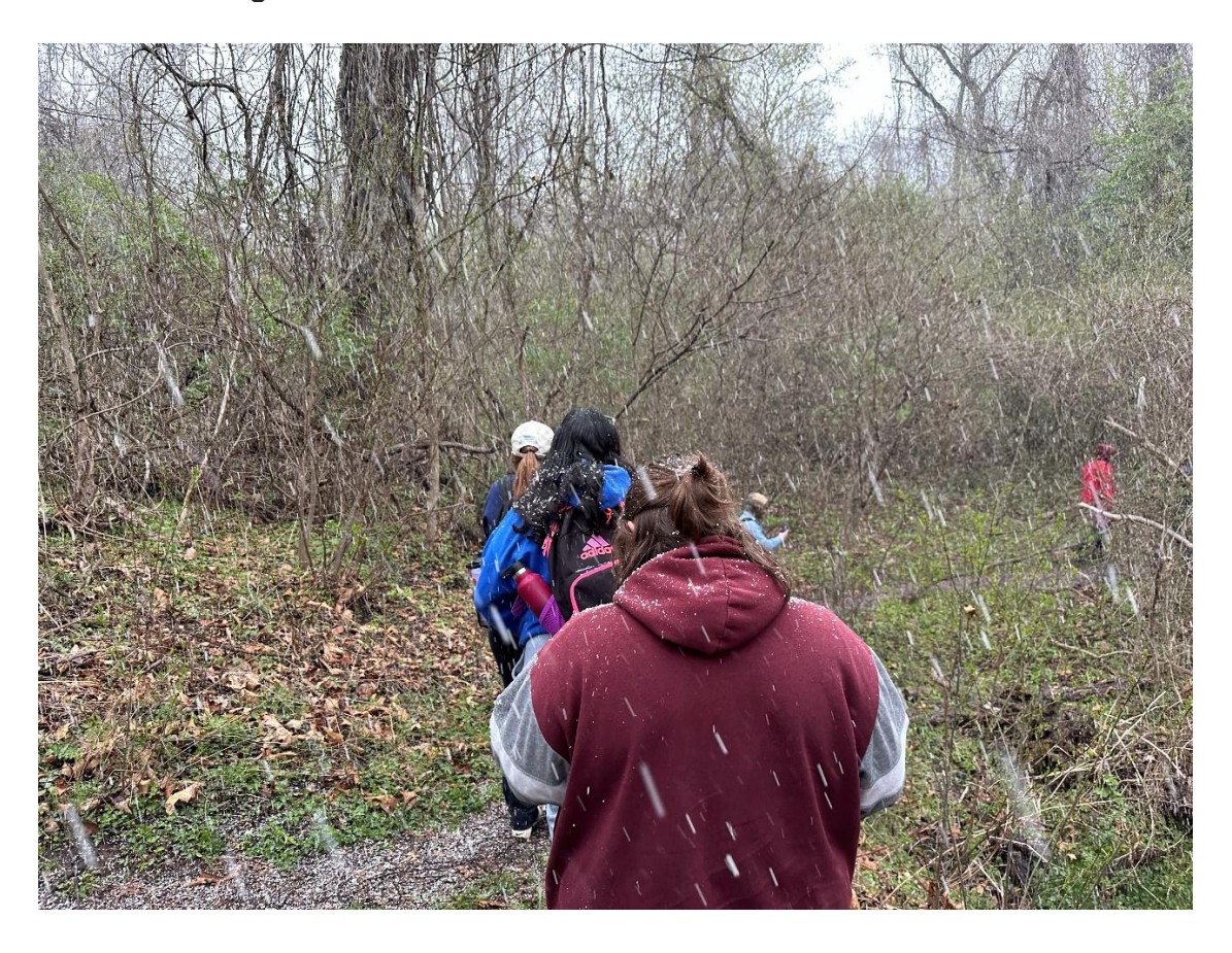
Photo : A snowy field trip to observe spring ephemerals in Mid-County Park in Christiansburg.

The class is a fun chance to share some knowledge and enthusiasm for plants with the next generation of scientists, conservation managers, and policymakers. Hopefully they come away with a deeper appreciation of the wonder of plants and their importance in our ecosystems.