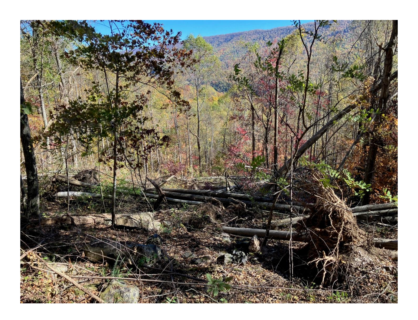
Photo1: South aspect forest with extensive windthrow at Chestnut Ridge NAP.

At Chestnut Ridge Natural Area Preserve, storm damage was highly variable. Forests on the south slopes experienced the most windthrow, while older stands and north aspect forests appeared less impacted. I'll also add that this summer saw the most extensive invasive species management ever (not hyperbole!) across Chestnut Ridge NAP. In hindsight, considering the disturbance that followed, that appears to have been particularly serendipitous.