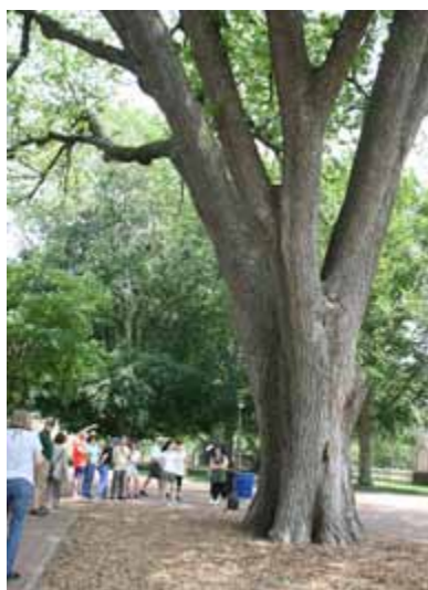
We admire that big American Elm.

Although the bamboo ( Phyllostachys ) at Crim Dell's east end has been “eradicated” at least once, it is persistent, and we could see new growth near the cut stubs of old canes. Crim Dell's pond, below, undergoing its periodic draining and dredging, is presently just a muddy depression.