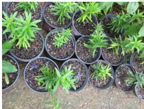
The five-inch plugs are getting ready to bloom after three weeks!

I wish all of you a happy and relaxing summer!