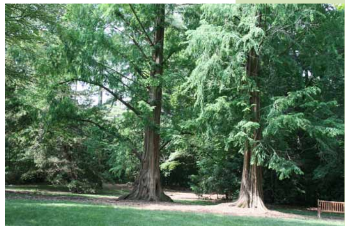
The Dawn Redwoods at the foot of the Sunken Garden