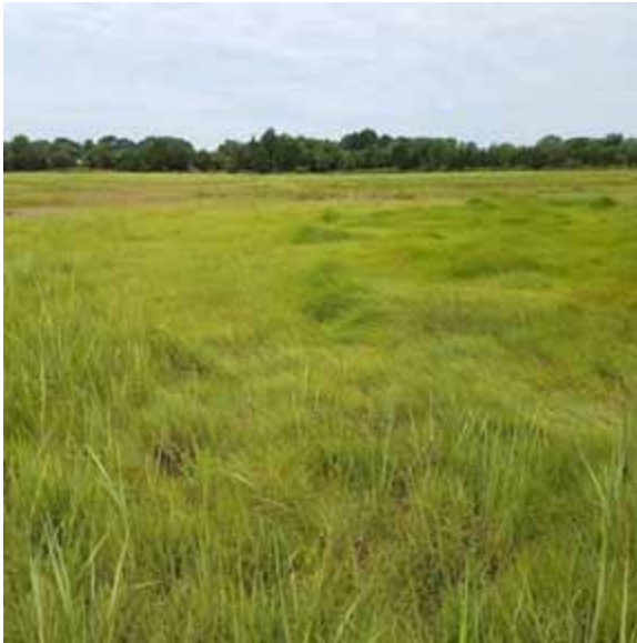
An overall view of the marsh

...and a few photos she took during the walk