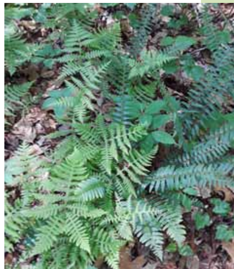
Broad Beech Fern, left, and Christmas Fern, right