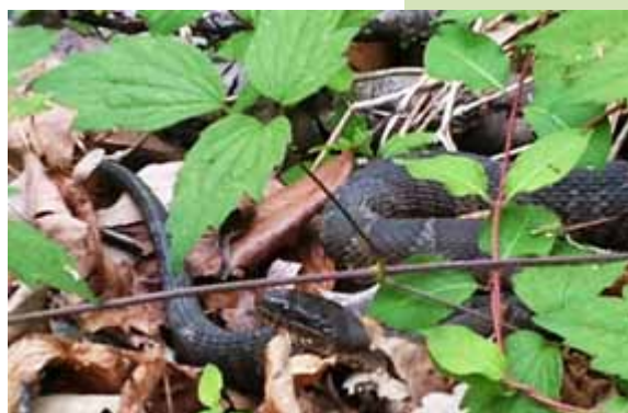
A Northern Watersnake