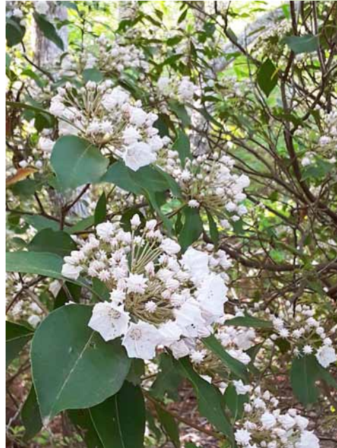
Mountain Laurel in bloom

As we emerged onto the improved trail, we found Rattlesnake Fern beside the trail. That hadn't yet appeared when the trail was scouted to plan the walk. Crossing Bridge 6, we visited a well-established colony of Galax which