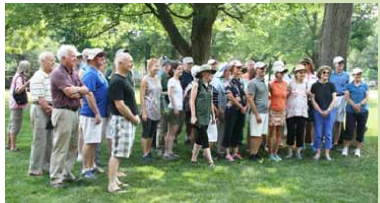
Our group poses for a photo in the Wren Yard.

There were several blooming Southern Magnolias ( Magnolia grandiflora ) near the Wren Building to see and sniff. As we strolled toward Crim Dell under the American Beech ( Fagus grandiflora ) allée on the north side of the Sunken Garden, Beth explained that in the 18th century, "garden" was used to describe a grassy lawn like this, not a planting of flowers or vegetables. Between the foot of the Sunken Garden and Crim Dell is a pair of towering Dawn Redwoods ( Metasequoia glyptostroboides ) planted from seeds Biology Professor J.T. Baldwin acquired in 1948. Beth also pointed out a Black Walnut ( Juglans nigra ), a Bald Cypress ( Taxodium distichum ), Loblolly Pines ( Pinus taeda ), a Sweetbay ( Magnolia virginiana ) in flower, and the dark, blocky bark of a native Persimmon ( Diospyros virginiana ).