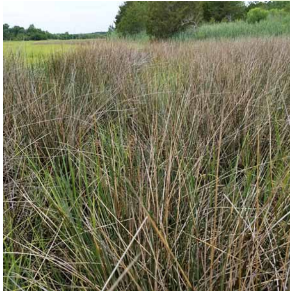
Black Needle Rush