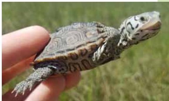
A juvenile Diamondback Terrapin