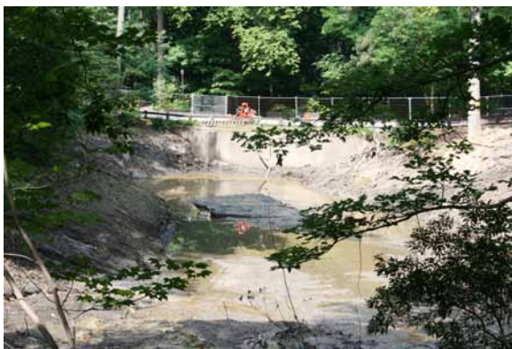
Crim Dell's pond, temporarily reduced to a puddle

Although the bamboo ( Phyllostachys ) at Crim Dell's east end has been “eradicated” at least once, it is persistent, and we could see new growth near the cut stubs of old canes. Crim Dell's pond, below, undergoing its periodic draining and dredging, is presently just a muddy depression.