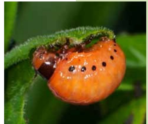
Seig Kopinitz's photos of milkweed beetles: Top, adult beetles mating Center, young larvae Bottom, an older larva