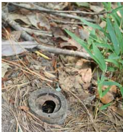
A dead bamboo stump, with new shoots at right