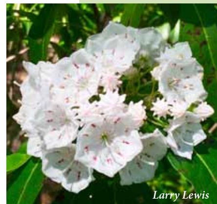
Mountain Laurel blooms