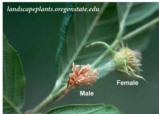
Male and female flowers of American Beech

Other familiar species are monoecious, producing both male and female flowers on the same tree. Alder ( Alnus serrulata ) has male flowers in dangling catkins and the female flowers are short cone-like spikes located below. Oaks produce male catkins in drooping clusters, and the female flowers that will form the acorn and cup are solitary or in a spike with few flowers. American Beech ( Fagus grandifolia ) is another monoecious plant with male flowers in clustered, drooping heads and females on short stalks. These are unisexual flowers—only male or female organs but not both.