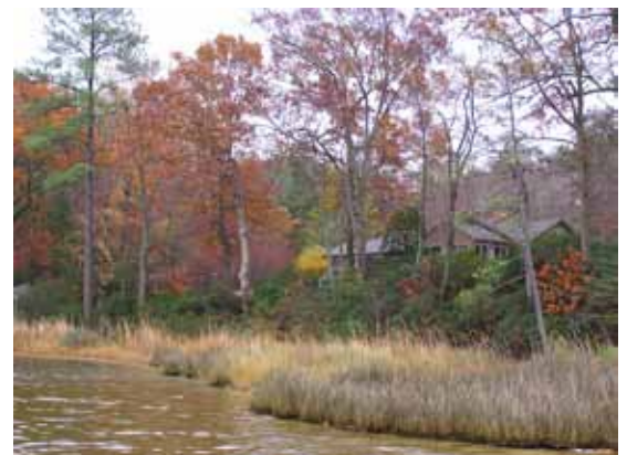
A model shoreline

NOTE NEW MEETING PLACE: The meeting will be held at 7 pm on Thursday, March 15 , at the York County Public Library, 8500 George Washington Memorial Highway (U.S. Rt. 17) at Battle Road (immediately north of York Convalescent and Rehabilitation Center).