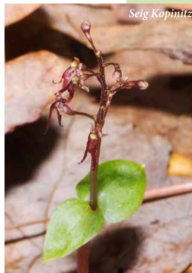
Southern Twayblade orchid