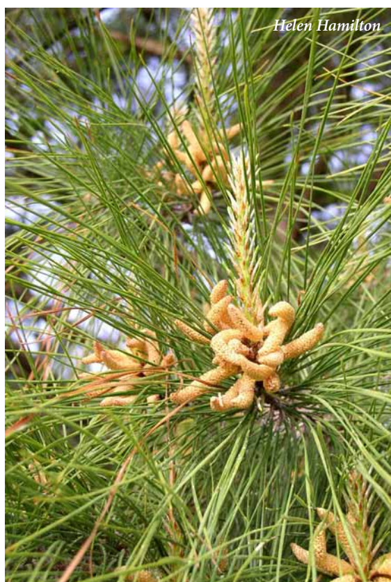
Male flowers of a Loblolly Pine

Among conifers Loblolly Pine ( Pinus taeda ) is conspicuously monoecious. Young female cones are yellow and near the growing point of the twig; mature female cones are large and woody. The pollen released by the tiny male cones in early spring covers surfaces with a yellowish powder. Researchers have found the pollen can travel as far as 1,800 miles from its source, and remains viable despite exposure to moisture, cold, and UV radiation from sunlight. Pine pollen is suspected of causing allergic reactions, although very few people are affected.