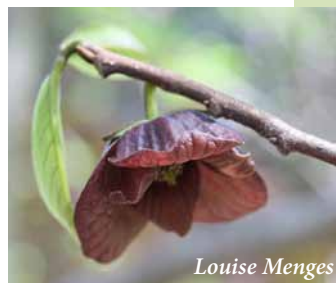
A Pawpaw flower