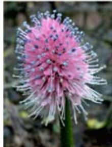
Swamp pink ( Helonias bullata )