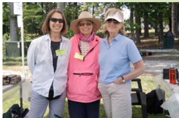
Who were those masked women?