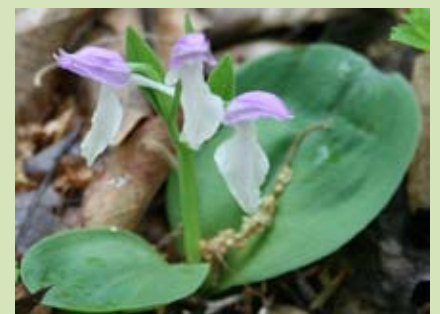
From top: Claytonia virginica ; a 5-petaled bluet; a violet; pink lady's slipper; showy orchis.