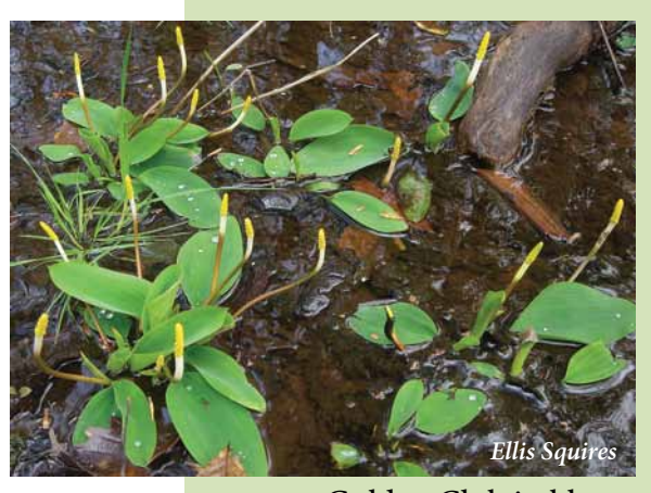
Golden Club in bloom