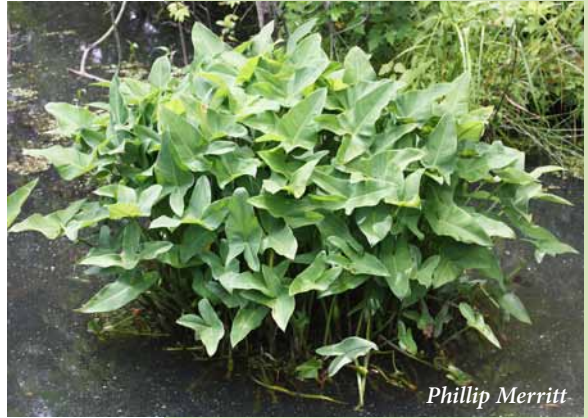
Arrow-arum's foliage, above, and an opened seed-pod, below

Other members of this family from the tropics are grown as familiar house plants. Peace Lily ( Spathiphyllum ), Philodendron , and Dieffenbachia are sold locally in garden centers and nurseries. Another relative, Caladium , also known as Elephant Ears, is grown for its colorful foliage and is often planted in woodland gardens Helen Hamilton