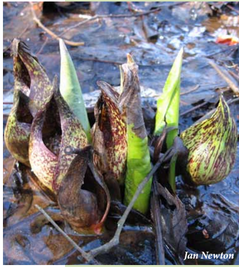
Flowering Skunk Cabbage

While birds and mammals eat the berries of this plant, all parts produce intensely irritating calcium oxalate crystals. Native Americans