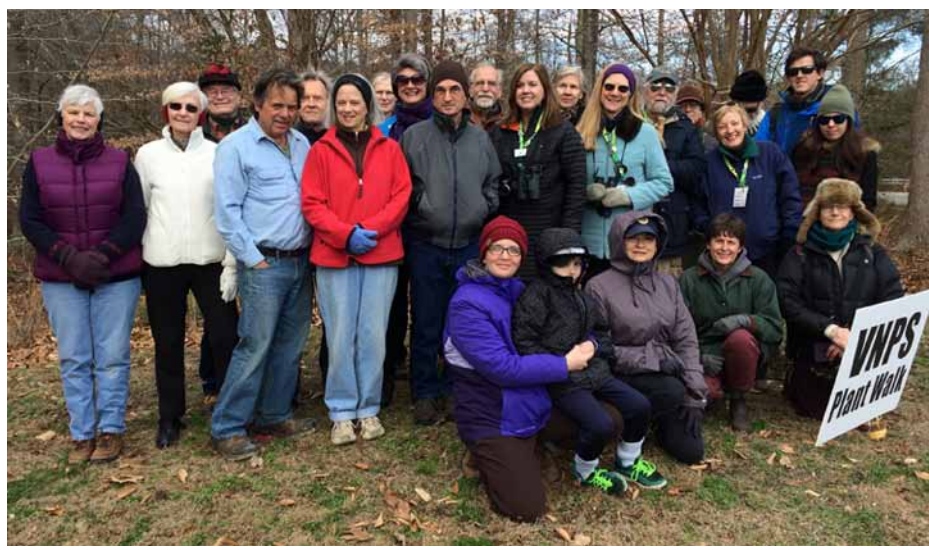
Helen Hamilton's photo of the (mostly) warmly dressed participants on the Skunk Cabbage walk