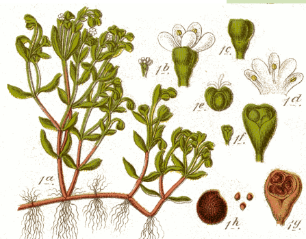
A botanical drawing of Montia fontana (water-blinks), provided by Donna

The walk will begin at 5:15 pm and last until 7:00 (or whenever you need to leave)—no need to register. Please bring a hand lens if you have one, and park in the portion of the parking lot closest to the wing of the building where our membership meetings are held.