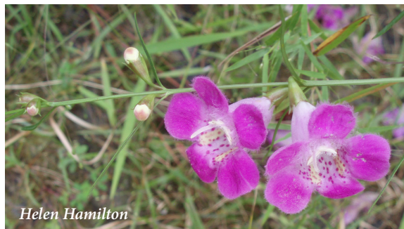
Purple false foxglove

while depending upon the roots of host plants for water and nutrients.