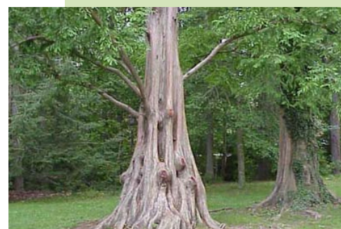
A Dawn Redwood grows near the College's Sunken Garden.

Register by calling 757/564-4494 or helen48@cox.net.