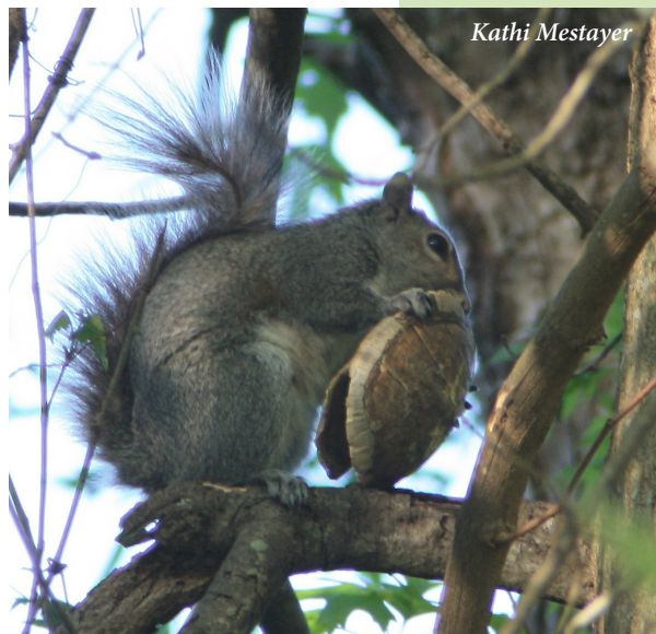
Squirrels are well-known thieves, like this one that stole a turtle shell from my front stoop.