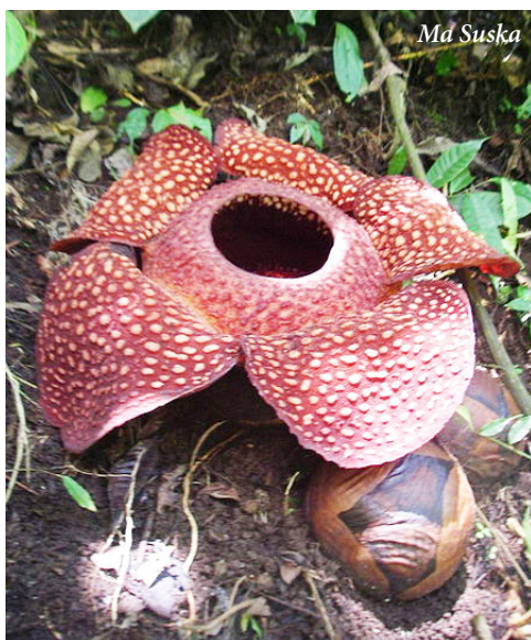
Corpse flower ( Rafflesia arnoldii )

Fully parasitic plants are without chlorophyll and wholly dependent upon the stems or roots of host plants for water, minerals and carbohydrates. One of the most bizarre is the “corpse flower” of Malaysia and Indonesia, with a blossom over 3 feet in diameter. It smells like rotting meat to attract flies as pollinators, and rodents spread its sticky fruit. With no leaves at all, this plant is an obligate parasite, stealing its nutrients from the roots of neighboring vines.