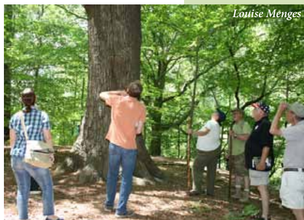
We admire one of those majestic trees.