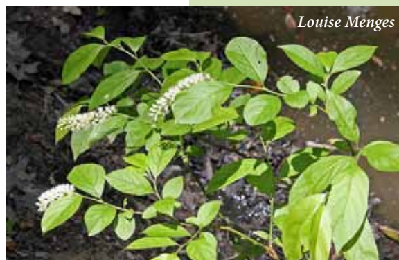
Virginia sweetspire blooms at the edge of a stream.

In the grassy area adjacent to our parking area we spotted some blue-eyed grass ( Sisyrinchium spp.)