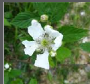
Flowers are the sex organs of flowering plants.