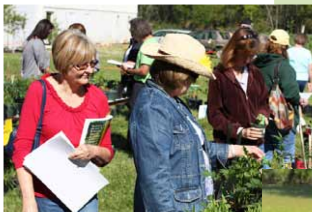
Shoppers look over our offerings.