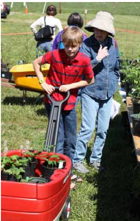
A 2014 Nature Camper assists a visitor with her purchases.

There may be walks in the works which did not make this issue, so keep a eye out for announcements about additional walks and other events on our website at www.claytonvnps.org and in the local newspapers.