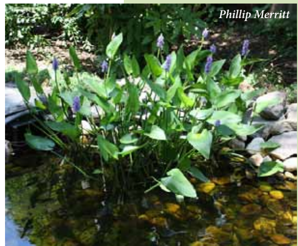
Flowering pickerel weed

Pat also led us to a very nice clump of fifteen or more wintergreens in bloom. I've never seen such a vigorous patch before! Usually they seem