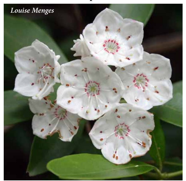
An up-close look at mountain laurel flower structure.

The highlight of the walk was a demonstration by Donna as she pretended to be a pollinator of the Mountain Laurel. Mountain Laurel flowers have stamens that are held within the folds of petals under tension.