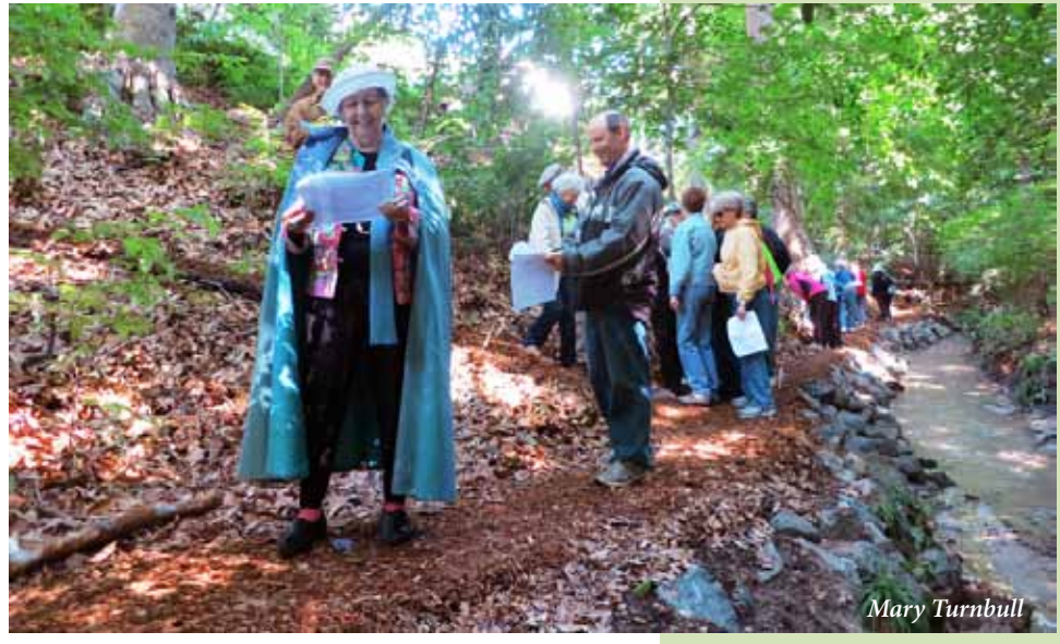
Everyone was looking for the 88 native plants on the printed list.

"I liked the very delicate flower of Hearts-a-bustin." "I was impressed by the white canopy of the Alternate-leaf Dogwood." "I learned how to iden-