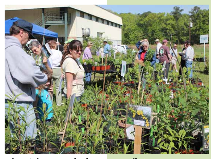
Plant Sale visitors look over our offerings.