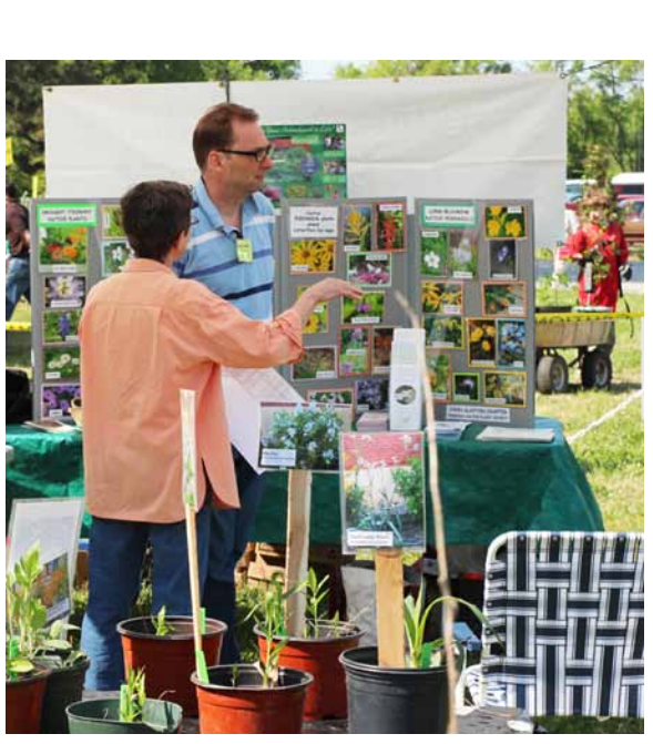
A consultation with the Prez.