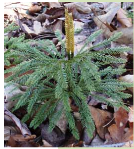
Common ground pine