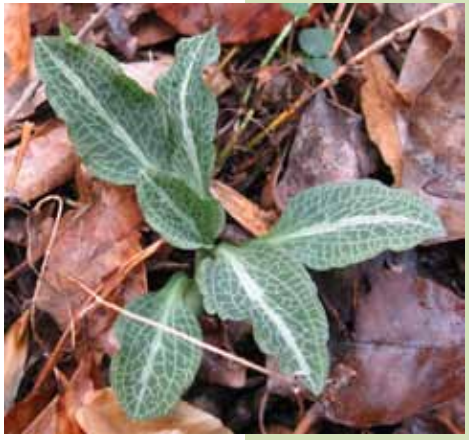
Top, partridge berry (Mitchella repens) Bottom, rattlesnake plantain (Goodyera pubescens)