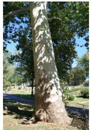
The sycamore—maybe not a champion, but impressive.

What about trees, you ask? Hollywood was named for the many American hollies already growing on the site, and plenty of large specimens were in evidence. We noticed many big old trees during our visit, including an American sycamore ( Platanus occidentalis ) our guide identified as a state champion (although it isn't listed in Remarkable Trees of Virginia ), but missed seeing the blackgum ( Nyssa sylvatica ) whose photograph graces pp. vi–vii in that volume.