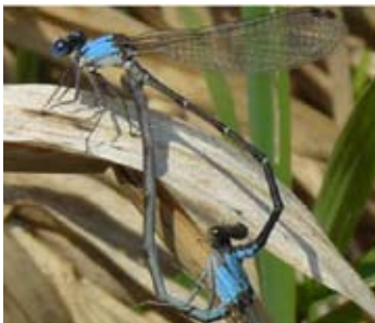
Damselflies should get special recognition for athleticism!

The talk showed the importance of gardening with native plants to feed birds and butterflies. Alien ornamentals take the space needed to grow plants that feed insects that feed birds and butterflies. Developments and industrial agriculture have removed lands that supported larger populations of wildlife, now with no place to hide other than patches of woods and meadows. Homeowners can help by removing invasive species and installing the native plants preferred by songbirds and butterflies.