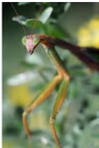
A praying mantis, probably digesting her last partner.