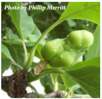
One look at its seed pods tells you how the tree came to be called "cucumber" magnolia!