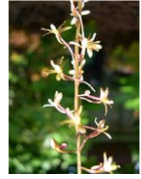
Cranefly orchid bloom; photo on Flickr by jpc. raleigh.

When the orchid blooms in mid-July, no leaves are visible. The flower of Cranefly orchid is inconspicuous. Pale green and pale purple to beige, no more than ½ inch across, it is easily overlooked, unlike the winter leaf which signals the presence of this