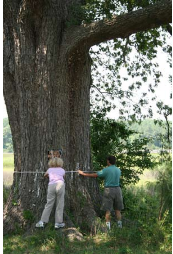
Lucile Kossodo, Byron Carmean and Gary Williamson, who is hidden behind the tree, measure the circumference of the Gloucester champion southern red oak ( Quercus falcata ) at Starvation. (For the purposes of these photos, we could establish the Lucile as a unit of measurement; this tree would then have a circumference of more than 21 Luciles !)