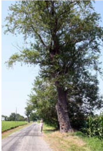
A very large black cherry ( Prunus serotina ) spotted at Starvation; for scale, compare to a Lucile near its base.