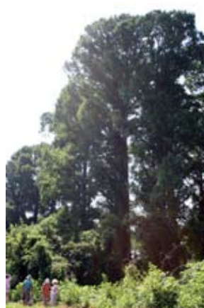
This group of baldcypress ( Taxodium distichum ) could be seen from some distance towering above other trees in a swale across the road.