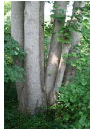
A large multi-trunked tulip poplar ( Liriodendron tulipifera ) spotted near the grove of baldcypress