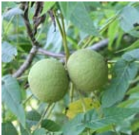
We did not see the old black walnut ( Juglans nigra ) still standing at Coke, but did find likely descendants in fruit.