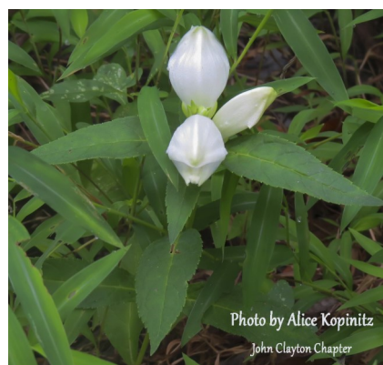
John Clayton Chapter

The White Turtlehead is native to all counties served by John Clayton chapter, and we will make every effort to secure some White Turtlehead plants for the plant sale on May 4th.