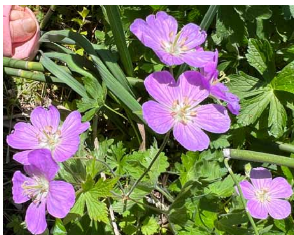
Photo 4, and Photo 5 are? If you like blue flowers, can you guess what Photo 6 and Photo 7 are? If you like yellow shades, can you guess what Photo 8 is? If you like red shades, can you guess what those in Photo 9 are? If you need to know, the answers can be found at the end of the article. No, these are not all the flowers but what is perhaps a bit less obvious. All the photos were taken on April 17 in my garden. Not all the plants photographed will be for sale on April 29, but many will. Summer flowers are great also and we will have many for sale.