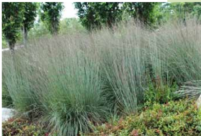
The fine textured, upright foliage of Little Bluestem makes it a standout in any landscape.

summer progresses, the foliage takes on reddish and even lavender tints before turning a rich copper-orange to orange-red in fall. The handsome bronzy-orange color persists through the winter, adding welcome color to fields and gardens. In August, purplish bronze flowers emerge on 3" long racemes held on branched stems above the foliage. These ripen into clusters of beautiful fuzzy, silvery-white seedheads that catch the fall and winter sun and are particularly lovely against the striking coppery-orange fall foliage.