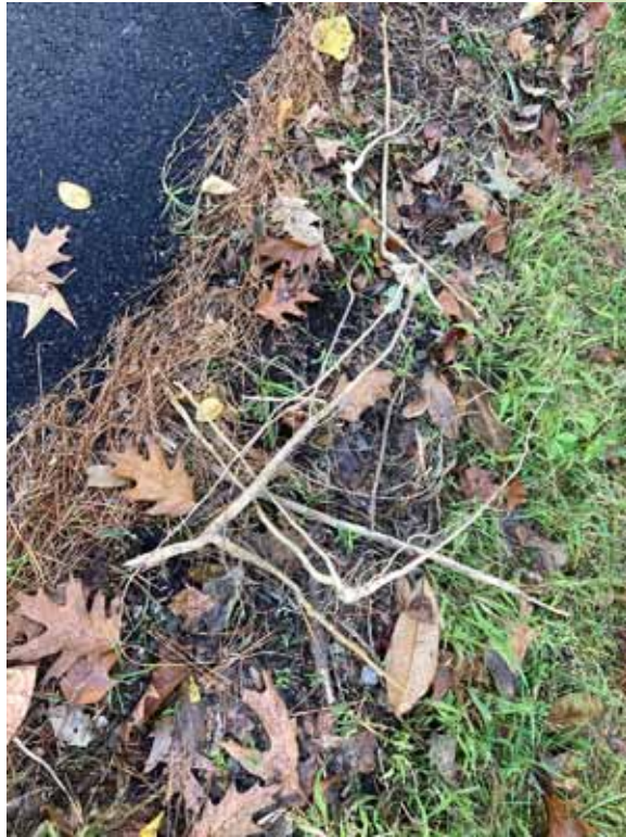
Their roots a week or so afterward

Another thing that surprised me was that, in some cases, if you damage a tree (like ailanthus) but don't kill it, it may respond with a vengeance. "Cutting down or girdling ailanthus causes it to sprout roots from its entire structure, requiring long-term maintenance." (ppt slide #32 on PRISM site) WHOA! SCAREY!