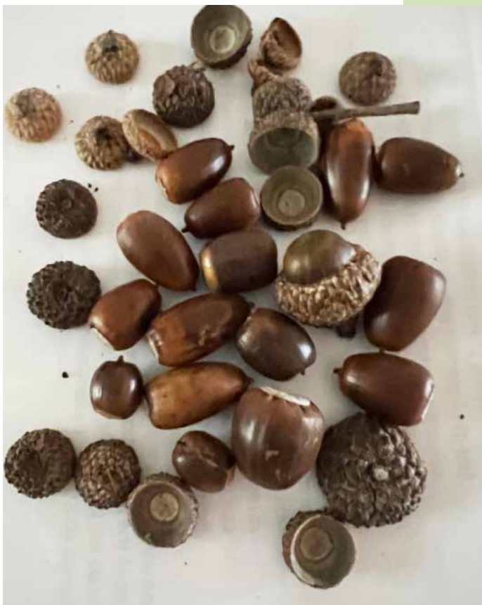
Lucile's photo of acorns and "lids" from her yard