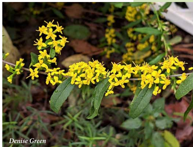
Denise Green Showy flower clusters and leaves of Blue-stemmed Goldenrod

Like many members of the Aster Family, they have ray and disk (composite) flowers. If you look closely, each tiny yellow “flower” actually consists of two kinds of smaller flowers: 3 to Blue-stemmed Goldenrod 5 tiny ray florets encircle a central disc composed of tiny tubular florets creating a “composite” flower. These tiny flowers are rich in pollen and nectar and support an extremely diverse array of pollinators and bees. Goldenrods also provide critical late season nectar for migrating butterflies such as Monarchs, Painted Ladies, and Common Buckeyes. At least ten species of Fall specialist bees depend on the pollen from goldenrods to feed and raise their young, emerging only when goldenrods are in bloom. And readers that follow the eminent author and entomologist Doug Tallamy already know that Goldenrods host over 100 species of butterflies and moths, more than other herbaceous perennials. And if that is not enough wildlife value, goldenrod