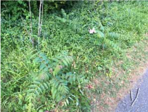
Some of the small ailanthus saplings before Kathi pulled them out by hand

ple was that ailanthus can often be effectively pulled out when it's up to 3–5' "tall." I tried this recently, at a corner of my neighborhood, and they came up pretty easily, with lots of roots attached.