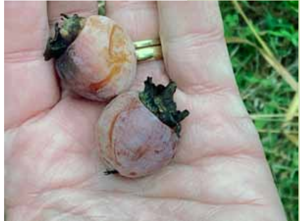
A couple of yummy-looking ripe persimmons

Just a few months ago, I discovered a couple of native persimmon trees near the corner of a street in my neighborhood. I started keeping an eye on them, to see if they bore fruit. YES! As I write this, on Halloween day, there are probably 50 persimmons hanging on their branches, waiting to ripen and drop. It's hard to believe that they take this long to get yummy! Anyway, saw a couple with fruit near the trail at New Quarter Park, as well. Watching and waiting.