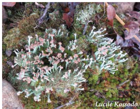
Pink Earth Lichen

in no way a mushroom. One can find this Pink Earth Lichen in Eastern North America from Alabama and Georgia north to the Arctic Circle. It prefers to grow directly on unstable soils such as loose sand or dry clay, and in full sun. It also prefers acid soils to neutral or alkaline. It is related to