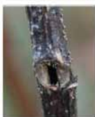
New York Ironweed

Perhaps the most noticeable wildlife at native plantings during the blooming season, insects are still present (but less visible) during winter. Many insects begin their life in late summer/early fall, overwintering as eggs or larvae in stems during the cold weather. Others overwinter as adults, hibernating in the standing stems of plants. Some species also hibernate in leaf matter, beneath bark, or under the ground. All of these insects are the ones that will be visibly using native planting when warm weather arrives again. If native plants are cut back as is routinely done in fall with non-native plants, these vulnerable insects may accidentally get cut. Cold air and rain may also get in the opening in the stem that is created and, since the insect is hibernating, it will not be able to move if the spot is no longer suitable. Insects may also not be able to emerge from man-made piles of dead stems.