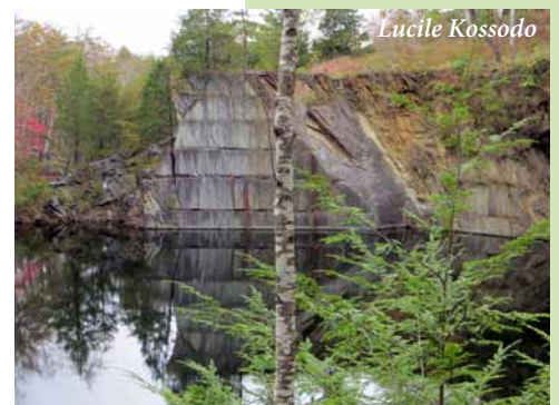
A view of the quarry

Late in October, I took a ride through the curving up and down Route 6 near Charlottesville towards the Quarry Gardens at Schuyler with three friends. We entered the gardens via a very rural road passing the area where The Waltons was filmed; there is a museum and you can buy souvenirs. We turned into Schuyler Road and found a huge stone announcing the Quarry Garden site. It is closed because of Covid-19 but one of the staff who was working allowed us to come and visit the garden when we told him we were VNPS members from the Coastal area. It is located near the Rockfish River. The gardens are in a 40-acre site where two retired soapstone quarries were located, and 400 acres of Virginia Conservation Easement surround it. In the Quarry Garden property, there are three forest communities. The Sempervirens issue of September 2020 described the garden and announced that it has become our newest registry site. The garden consists of trails where native plants abound. You can see prairie plantings,