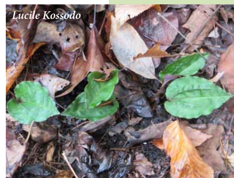
Lucile Kossodo Crane-fly Orchids

like a nice shaggy skirt. They live off decaying matter, being a sort of recycler. I admired the yellow Jack O'Lantern mushrooms ( Omphalotus olearius ) that were appropriate during the Halloween time of the year. They may look like chanterelle mushrooms, but these are poisonous even though they have an aroma like apricots. As you continue on the main path, there are paths that lead to benches overlooking the water where one could sit and admire the huge walls of the