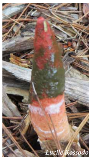
Lucile Kossodo Elegant Stinkhorn