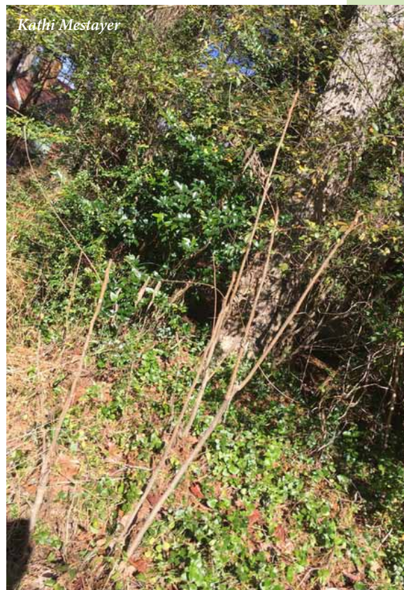
Dead ailanthus trees, still under surveillance.

And don't forget english ivy! Now's the time to cut-and-dab the vines, with a much-lower likelihood of ticks, chiggers, and the like. What could be more fun?