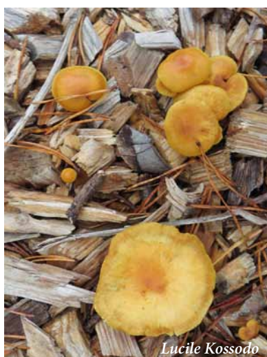
Lucile Kossodo Jack O'Lanterns

There was also Common Stinkhorn, Phallus impudicus , which has a green top. Both mushrooms have a nasty smell. They exude a liquid to attract insects like flies that feed on it and spread the spores in the forest. I also saw two lovely bell-shaped mushrooms that are Shaggy Mane Mushrooms ( Coprinus comatus ). They first appear like a closed umbrella and then open up to a bell-shape, at which time their white gills turn black. The white top looks