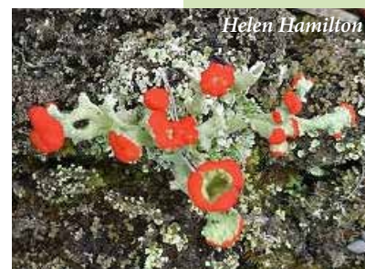
British Soldiers Lichen