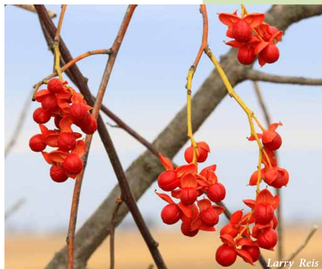
The fruits of American Bittersweet ( Celastrus scandens )

Oriental Bittersweet is a highly invasive species in Virginia. It is native to Japan, Korea, and China and was brought to this country in the mid 1800s as an ornamental. Now naturalized in states from Maine to Georgia and west to Iowa, this robust vine covers natural vegetation, forming thick pure stands. It can girdle trees, strangle shrubs, and the weight of the vine weakens the crown and eventually kills the tree. It takes over the landscape, like kudzu. Control is difficult—a few vines can be pulled by hand but any roots remaining will resprout.