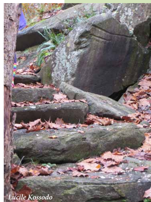
Those huge stone steps