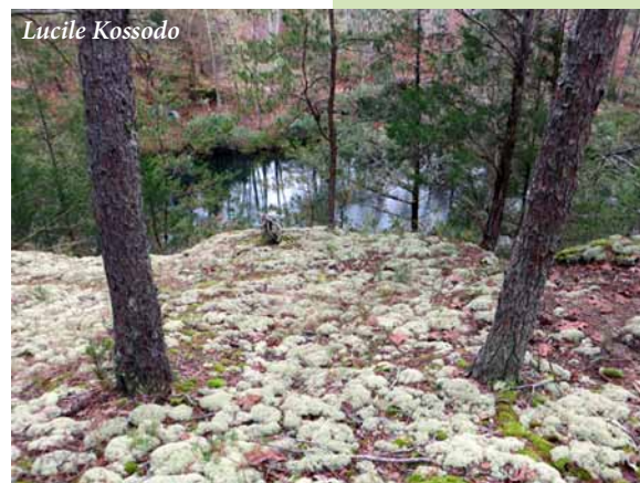
Mosses and lichens covering the ground

The view from above continued and it felt magical because of the mossy patches toward the steps. We then took a path down to the ponds via huge stone steps, made with stones removed before the workers arrived to the layers of the soapstone quarries. We came upon a huge stand of tall Royal Ferns ( Osmunda spectabilis ). There were Asters still in bloom. One such was a New England Aster ( Syphyotrichum novae-angliae ). There were many Wavy-leaved Asters ( Symphyotrichum undulatum ) with their pale colors blooming everywhere. I even saw some Zigzag Goldenrods ( Solidago flexicaulis ) in bloom; although there were other goldenrods, they were not in bloom. There were also many grasses in their fall colors and native plants no longer blooming.