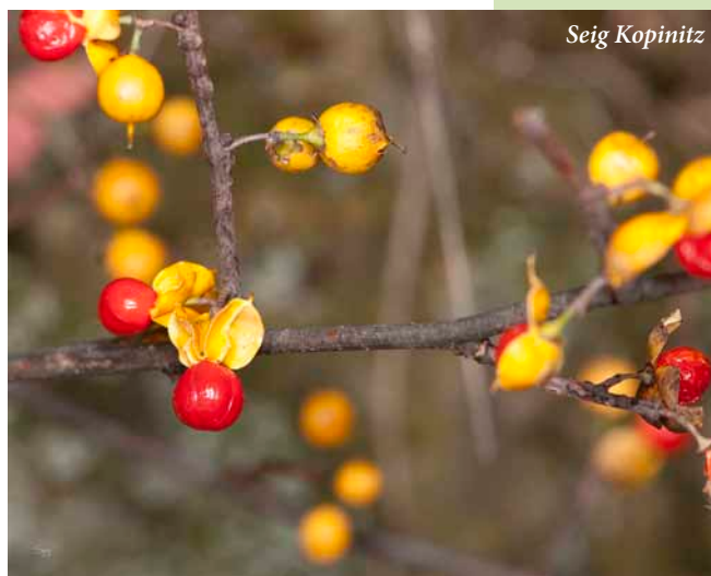
...and those of Oriental Bittersweet ( Celastrus orbiculatus )