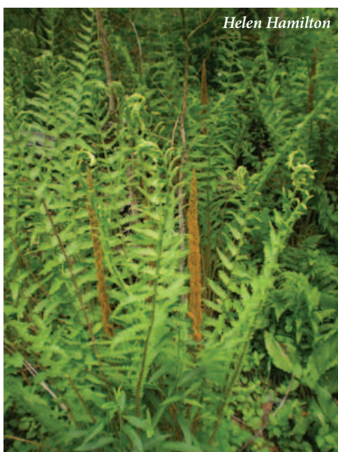
Cinnamon Fern, with its sporangia on separate stalks