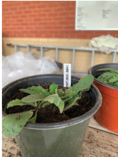
Freshly potted Lyre-leaved Sage