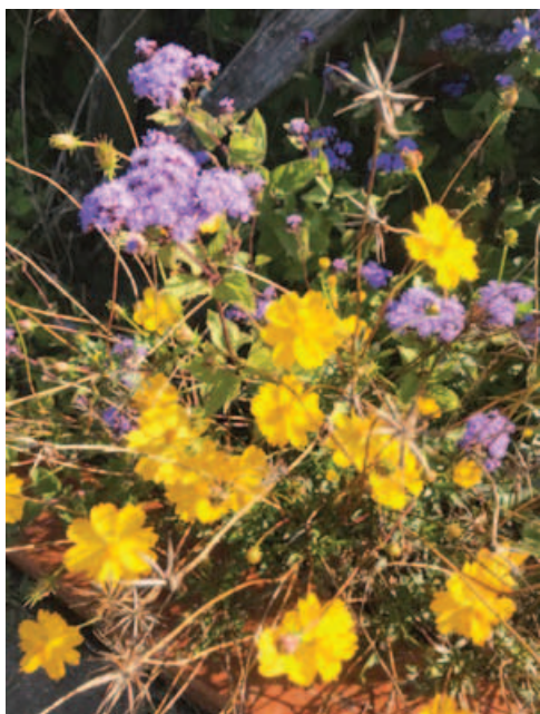
Coreopsis and Mistflower