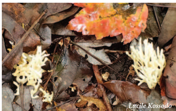
White Worm Coral Fungus