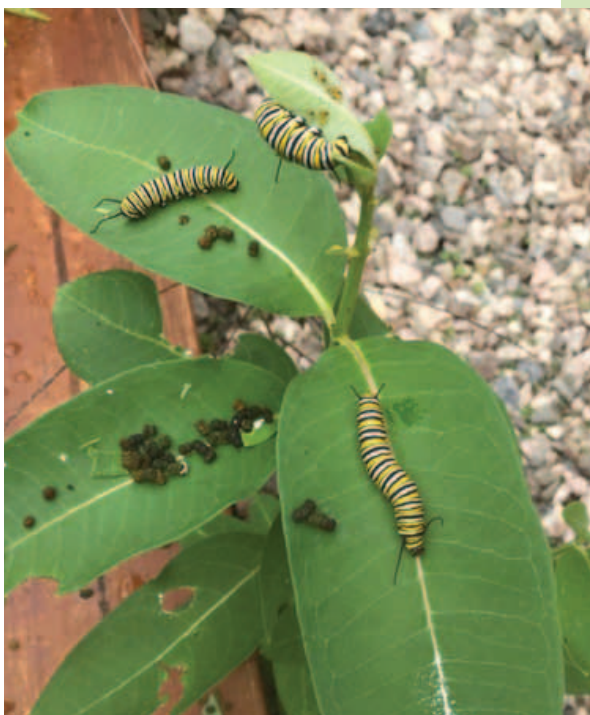
Three Monarch butterfly caterpillars feasting on Asclepias syriaca (Common Milkweed) near the Butterfly Garden at Stonehouse