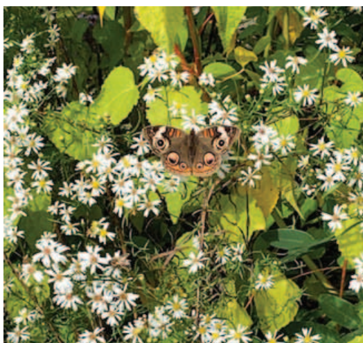
Common Buckeye on Frost Aster