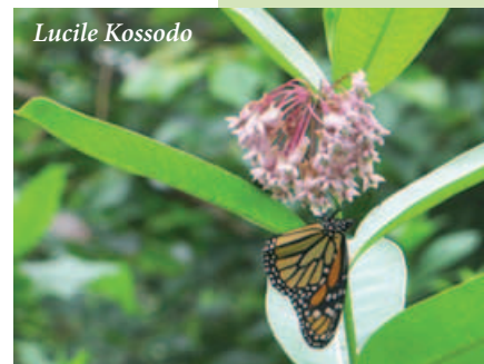
A butterfly feeds on native milkweed.

1. Shrink the lawn; 2. Rebuild the carrying capacity of the yard with keystone native plants; 3. Understand why alien plants are bad; 4. Planting for specialist pollinators; 5. Planting generously; 6. Do not spray or fertilize; 7. Educating neighborhood Civic Associations; 8. Use night lighting on timers rather than leaving it on during the whole night. He explains each of these points as well as why he recommends that we do them. Does he think making these changes will work? The answer is yes. Each book he has written expands on the ideas of his first book. I have often looked at the important message he wrote when he autographed my book Bringing Nature Home : "Garden as if life depended on it because it does."