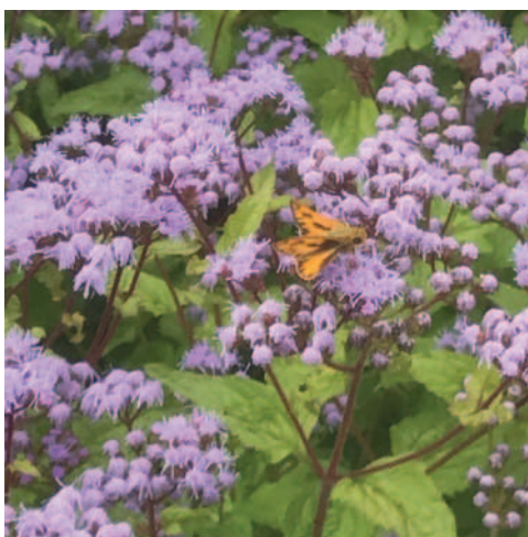
A skipper visits a Mistflower.