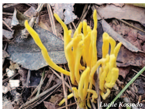
Golden Spindle Mushroom

A usual part of the fall activities started with our having two potting parties for the 2021 Native Plant Sale. I participated in the first one at Stonehouse Habitat Garden on Wednesday, October 7. It was a well-attended potting party, with all of us in masks. There was a second party on Sunday, October 18. Before the second potting party almost 100 plants were potted. Meanwhile, at home I have potted more than 50 more native plants and vines from my garden for the sale. Our 2021 Plant Sale is on the way!