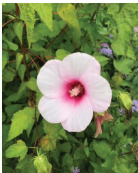
Close-up of flower of Hibiscus laevis (Rose-mallow, Halberd-leaf)