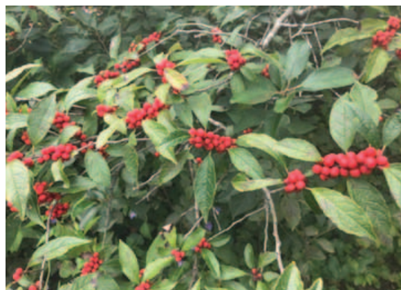
Close-up of female berries on Ilex verticillata (Winterberry) shrub at Stonehouse