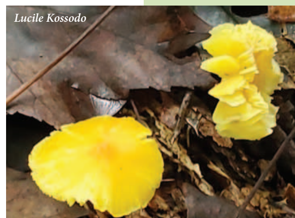
Lucile's mystery mushroom