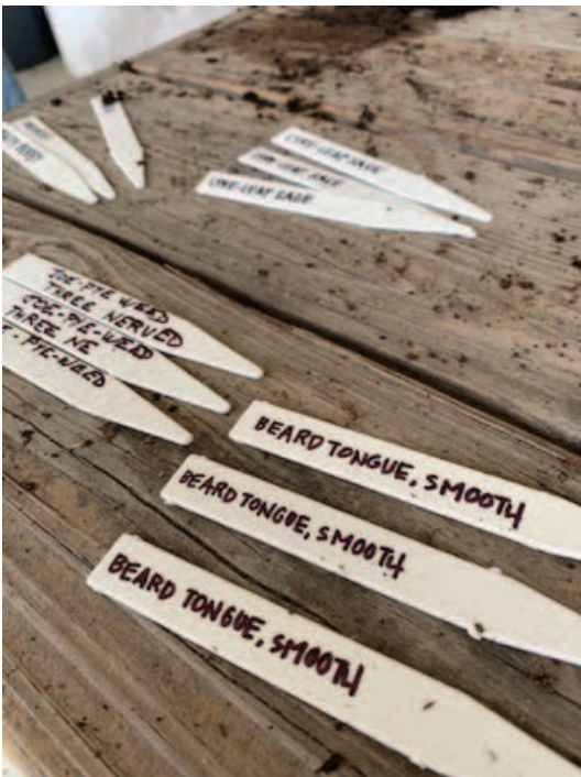
Labels for newly-potted plants