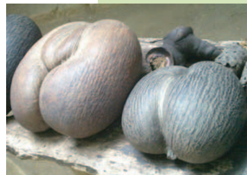
The huge seeds of a coco de mer

Fern sporangia are on separate stalks (Cinnamon Fern, Osmunda cinnamomea ) or on the underside of fronds (Lady Fern, Athyrium filix-femina ). Developing inside are tiny spores; when mature the sporangium slowly opens, then suddenly closes, throwing the spores out like a catapult. Mosses also produce minute spores, contained within sporophytes that consist of a stalk topped with a rounded or cylindrical capsule.