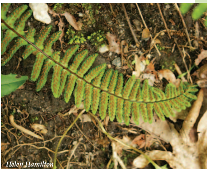
Lady Fern's sporangia are on the undersides of its fronds.