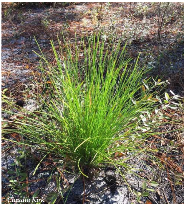
Grass stage seedling