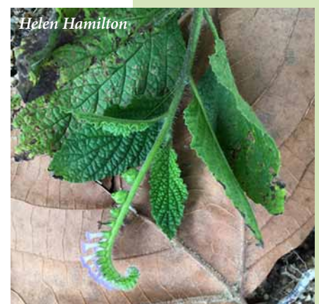
Indian Heliotrope in flower