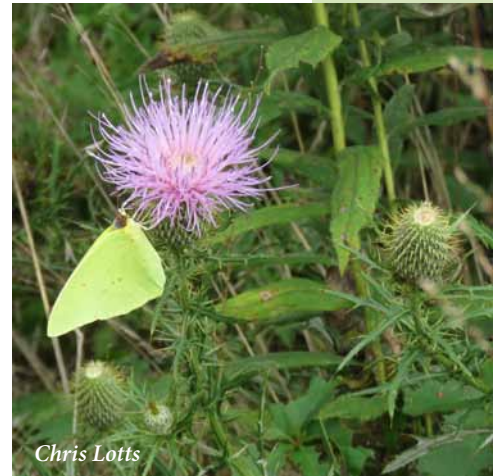
Chris Lotts A Cloudless Sulfur visits a Field Thistle.

During the walk on Saturday, one area hidden from view containing beehives was the highlight of the day. Here the Fireweed, Goldenrod, Passionvine, and other plants were full of insects. Variegated Fritillary caterpillars (red-orange with little spikes) were found eating their host plant—Maypop/Purple Passionvine. One participant discovered a caterpillar hanging upside down in a J shape, indicating that it was ready to turn into a chrysalis. A small group of Eastern Tailed-Blues were puddling together on damp compost and getting nutrients to help jump start the next generation. Other sightings included finding a Wolf Spider with babies all over its back, finding a watermelon among the tall grasses, and getting a brief update on the beehives from the beekeeper.