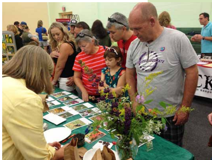
Expo attendees visit the John Clayton Chapter's booth.