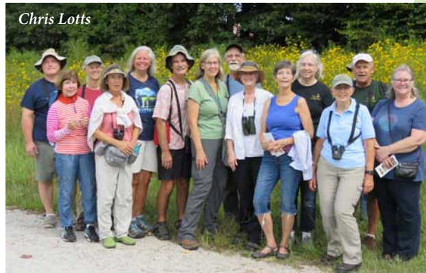
The day's participants gather for a photo.

The two-hour tour had 14 participants from the community, master naturalists, and our JCC of the NPS. It started off as a cool, cloudy morning, but by noon the sun was out, and we found 20 species of butterflies and hundreds of individuals. Here are some approximate numbers.