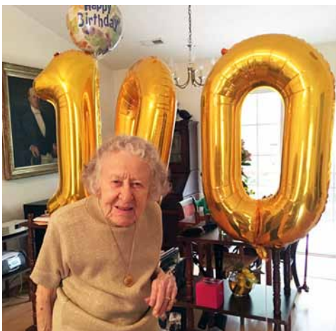
Some celebratory balloons