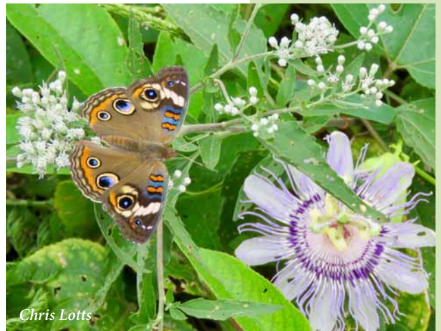
Chris Lotts A Common Buckeye near a Purple Passionflower