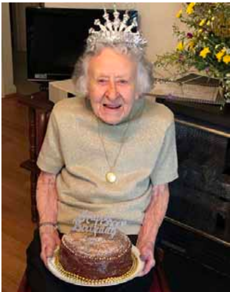
The Birthday Girl