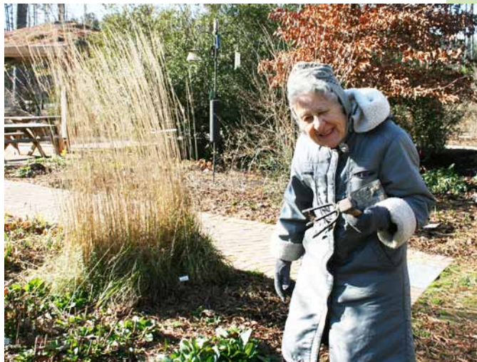
At work in the Botanical Garden