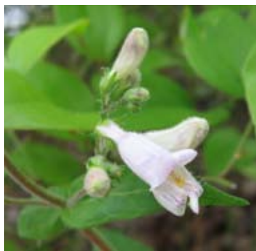
The unidentified penstemon

the back of the sand hickory leaves, resembling sand. We also examined the leaves of black oak ( Quercus velutina ), overcup oak ( Quercus lyrata ), sand post oak ( Quercus margarettae ) and farkleberry/sparkleberry ( Vaccinium arboreum ). Deerberry ( Vaccinium stamineum ) were in bloom, whereas highbush blueberry ( Vaccinium formosum ), red-berried greenbrier ( Smilax walteri ), and roundleaf greenbrier ( Smilax rotundifolia ) were beginning to make berries. Various penstemons were budding, including one that we have yet to identify. Donna was surprised and delighted to see Robin's plantain