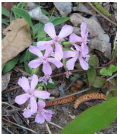
Sticky catchfly, a wild pink ( Silene caroliniana )

The group saw numerous wild pinks blooming in various areas, along with a fringe tree ( Chionanthus virginicus ), much rattlesnake weed, a few fetterbushes ( Leucothoe racemosa ), Solomon's seal ( Polygonatum biflorum ) and lyre-leaf rockcress ( Arabidopsis lyrata ), the latter being a mountain disjunct. We had just missed the bloom period for horse sugar, also known as sweetleaf ( Symplocos tinctoria ). Donna pointed out the difference between mockernut hickory ( Carya alba ) and sand hickory ( Carya pallida ): there are numerous silvery glands on