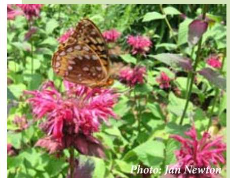
Spangled fritillary on bee balm.

Photos taken by Lance Gardner on a visit in April.