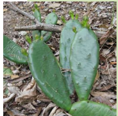
Prickly pear in bud