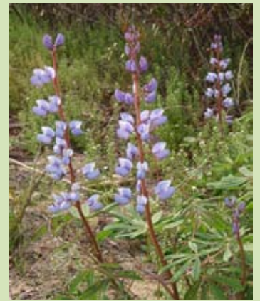
Top, bird's foot violets, and bottom, a few of the thousands of lupines Lance found in bloom in April.