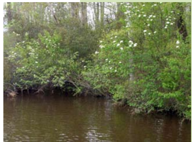
Shrubs blooming along the Mattaponi's bank.

As we sauntered along, there was definitely a lot to see and check out, with Pat pulling out one bag after another for samples to take back to the college. After about 3½ hours of checking out over 100 different species, we finally made it to the river, my personal favorite portion of the adventure. Edie has not yet been able to type up the list, so I can't share it with you here, but it was certainly long and filled with a large variety of herbaceous, vining, perennial, annual, ferny and woody vegetation.