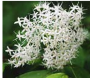
Swamp dogwood in bloom