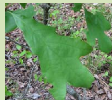
A comparison of the leaves of three oaks. From top: black oak, overcup oak and sand post oak.