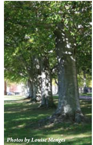
Two allées (well, half of each one)—the first, of catalpas, on the green in front of the Governor's Palace in Colonial Williamsburg; and a beech allée lining a brick walk behind the Wren Building.