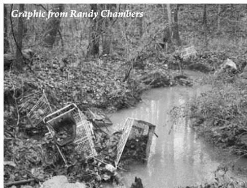
Here is a more recent photo of a portion of College Creek, littered with humans’ trash.