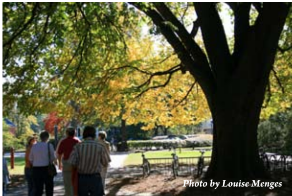
Our group pauses under a large American elm on campus near Ewell Hall.