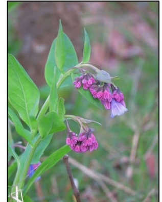
Virginia bluebell buds seen at Ivy Creek

The Jefferson Chapter has a small cadre of volunteers who have been leading these walks, but we can always use new leaders. (You can ease in gradually if you like by teaming up with an experienced leader for the first walk). Please email Mary Lee Epps ( mse5e@virginia.edu ) if you are willing to lead a walk or two. Upcoming dates: 3/21, 4/18, 5/16, 6/20, 7/18, 8/15, 9/19, 10/17 and 11/21.