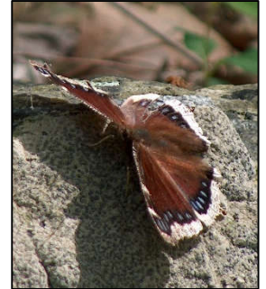
Mourning Cloak

These new adults estivate (i.e., remain dormant) through the hot, dry periods of summer. In the fall they will feed. Seldom nectaring on flowers, they prefer tree sap, rotting fruit, and the like, finding the nutrients and building up the energy they will need to overwinter as adults. Because of this life cycle, they may live 10 or 11 months, being one of our longest-lived butterflies.