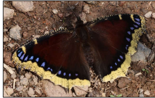
Mourning Cloak