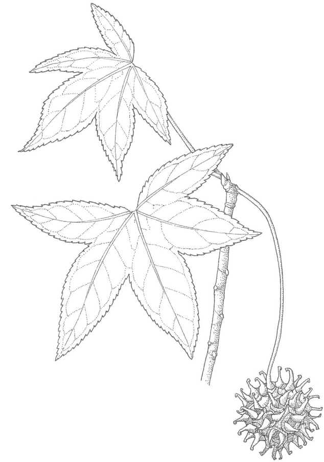
Illustration: Sweetgum, Liquidambar styraciflua , by Lara Call Gastinger, © Flora of Virginia Project

400 Blandy Farm Lane, Unit #2 Boyce, VA 22620 540-837-1600 • www.vnps.org