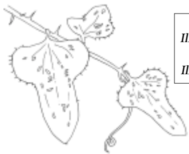
Greenbrier (left) Dogwood (right)