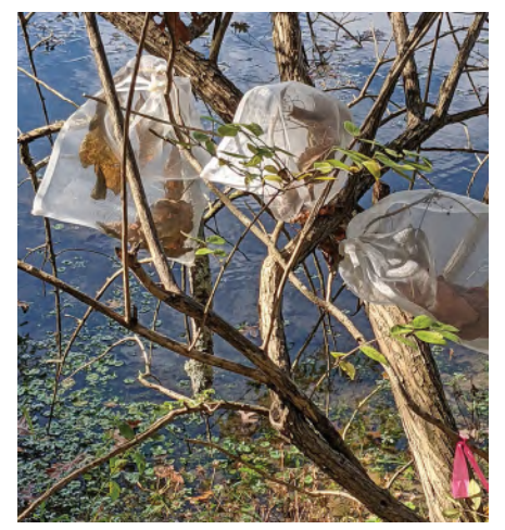
Bagged drupes reading for collecting on the McCormick Farm nature trail

In place of those dreaded clinical symptoms was now an intensely personal intellectual scientific curiosity (my children insist it is actually an obsession) about all aspects of poison ivy biology. Naturally, I realigned my scientific research program at Virginia Tech to singularly investigate poison ivy biology.