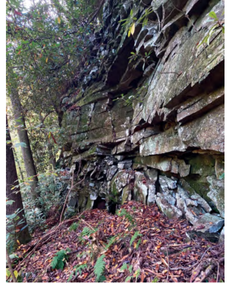
Rock outcrop in Cove Creek, Scott County.

This field season, one of my tasks was to examine a large block of steep mountain