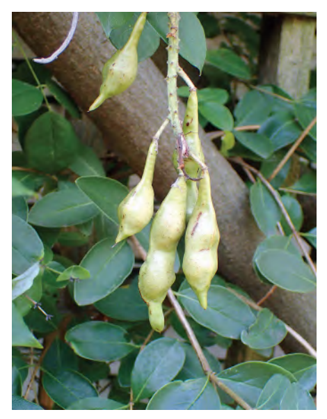
Figure 1 Late summer fruits of Wisteria frutescens , weeks prior to dehiscence.

"But wait," you might say, "Wisteria seed pods explode at maturity, ejecting seeds for distances of a few feet." True, but this fact may not be sufficient to discount fully the missing herbivoredisperser story. Wisteria frutescens fruits mature by late summer (Figure 1) but remain on the plant for another few months before finally blowing apart in late fall, well after leaves have dropped. At the moment of dehiscence, there is little inside a Wisteria seed pod besides a few very hard seeds. However, I suggest that those very same fruits will have had more food value when the seeds first mature in late summer and I can cite an image of Wisteria frutescens fruits, published by Wang et al. (2006), showing a matrix of soft tissue between the fruit walls and tough seeds in support of this assertion. I am suggesting that fruit maturation in Wisteria may be similar to that of the common Green Bean, young pods of which offer food value before they dry and shrivel to the point of spontaneous dehiscence. Perhaps, I suggest, Wisteria fruits evolved to take advantage of megafaunal fruit eaters as a first mode of long-distance seed dispersal, but if