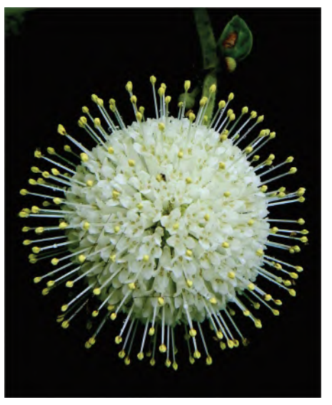
Figure 1. Head-like inflorescence of Cephalanthus occidentalis resembling a powder-puff or brush; pollen is first shed from anthers in closed flower buds and then presented to pollinators from stigma surfaces after flowers open.

First, let's consider the inflorescence and individual flower duration. Buttonbush flowers are grouped into spherical clusters containing, roughly, 120 to 200 flowers. (Figure 1) Individual flowers, isolated from the cluster, are illustrated in Figure 2 . Within a given cluster, 90% of the flowers