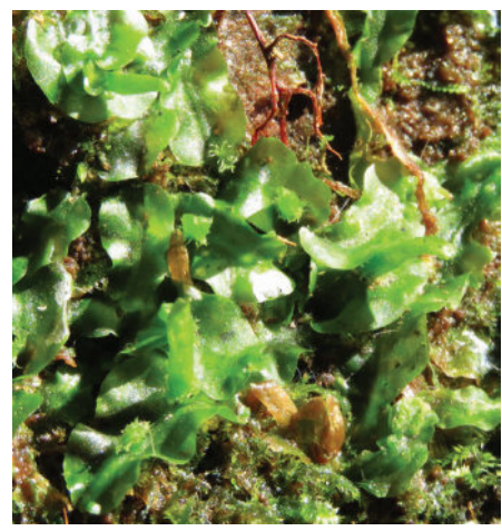
This liverwort, Pallavicinia Lyellii, was spotted on a field trip at the Annual Meeting.