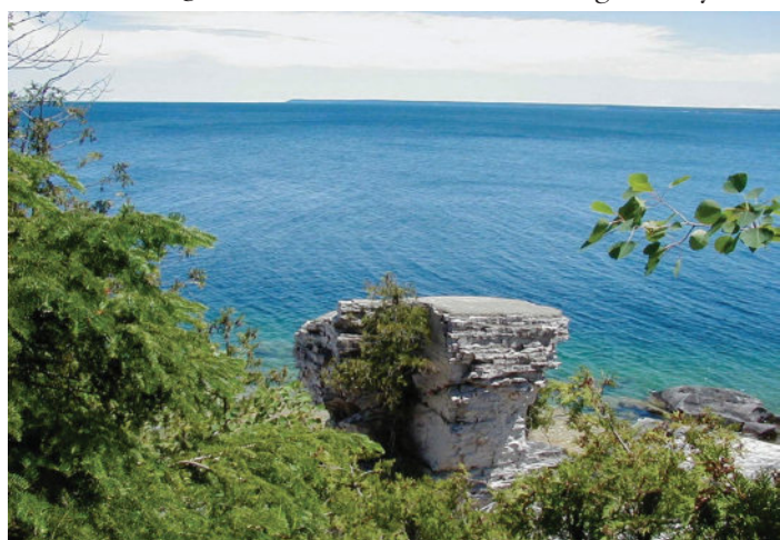
A stone flower pot from a promontory on Flowerpot Island at the northern end of the Bruce Peninsula.

shore of Lake Huron and visit sites including Flower Pot Island, the singing sands of Dorcas Bay, and several fens and limestone pavements. Along the way we hope to see many