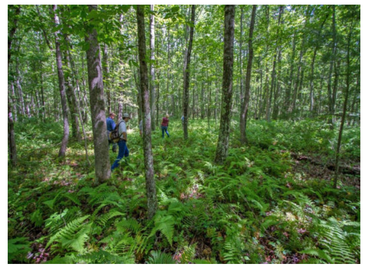
Exploring the recent addition to Mount Joy Ponds Natural Area Preserve.

Having supporters who truly embrace the primary charge of the Natural Heritage Program is a really special thing. We want you to know all of our staff appreciate it. And, your ongoing support sends a critical message. There are citizens out there who care and want preserves to be a part of the Virginia landscape—now and for future generations! �