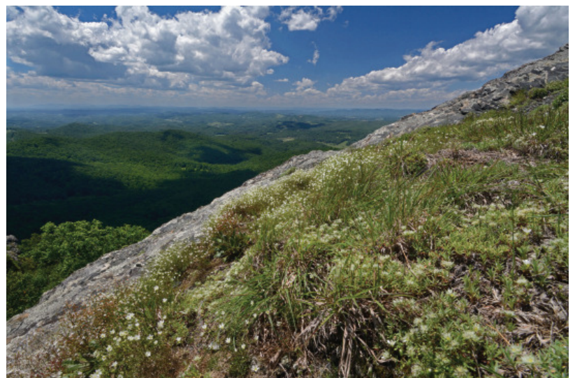
Open summit at Buffalo Mountain Natural Area Preserve.