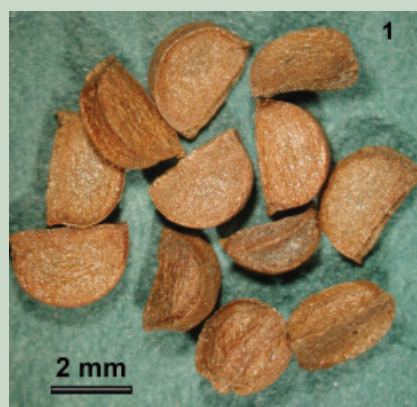
Figure 1. Dormant seeds of Actaea racemosa .