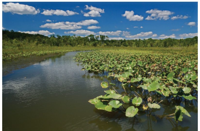
Freshwater tidal marsh along Accokeek Creek at Crow's Nest Natural Area Preserve.