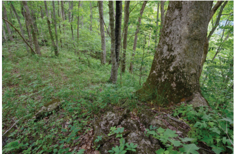
Rich forest at Pinnacle Natural Area Preserve.

By mid-May, most plants of the forest and marshes have emerged and the neotropical migrant birds are back and setting up breeding territories. The experience of this preserve