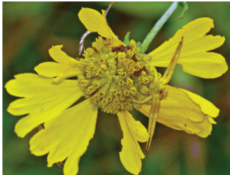
A camouflaged crab spider waits for its next meal while perched on Virginia Sneezeweed at Mount Joy Pond.

The Mount Joy Special Area Acquisition and Restoration Project was one of 16 designated awards announced in a special ceremony attended by many local, state, and federal leaders and held in the Waynesboro city council chambers. Included in the awards were three projects within the city, where the mercury contamination took place in the first half of the 20th century.