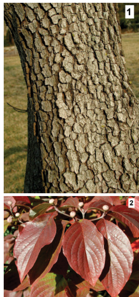
Figure 1. Cornus florida , bark of a mature tree. Figure 2. Cornus florida , next spring's flower buds in late fall, just before leaf drop.

DCR describes the site as follows: “On the western slope of the Blue Ridge in the Shenandoah Valley, Cowbane Prairie Natural Area Preserve protects the last remnants of wet prairies and calcareous spring marshes—now rare natural communities that once blanketed much of the Shenandoah Valley.” Cowbane Prairie is home to 11 rare plant species, and the adjacent South River provides habitat for two rare