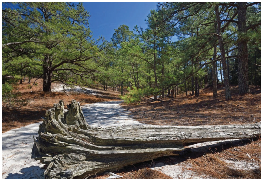
Open dune woodland at Savage Neck Natural Area Preserve.