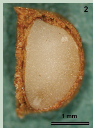
Figure 2. Dormant seed of Actaea racemosa , longitudinal section. Embryo is the small heart-shaped structure (bottom), everything else contained by the seed coat is food-storing endosperm.