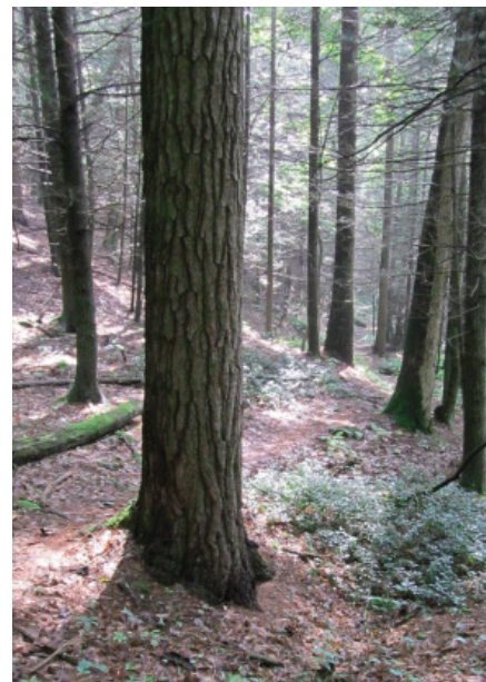
Forests and trees, such as old growth forest, (seen here in Ramseys Draft Wilderness) will be the focus of the Winter Workshop.

More information about the Winter Workshop, including registration information, will be available at the end of January.