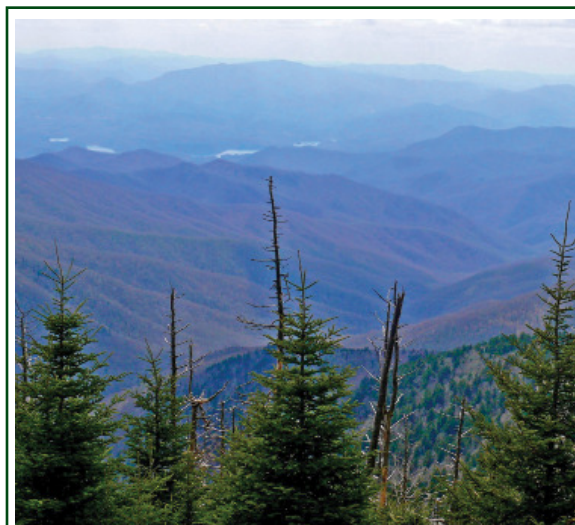
Travelers on the Society's upcoming trip to the Great Smoky Mountains are in for vistas such as this one from Clingman's Dome.