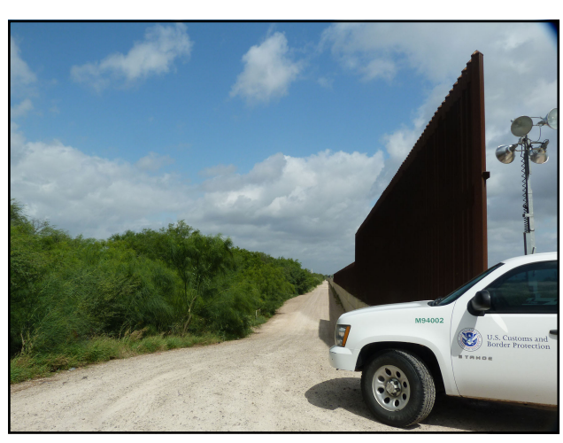
Looking down the border wall at the Lower Rio Grande NWR. Note the wide swath of cleared land, the cement wall, the 30-foot fence, and the lights.