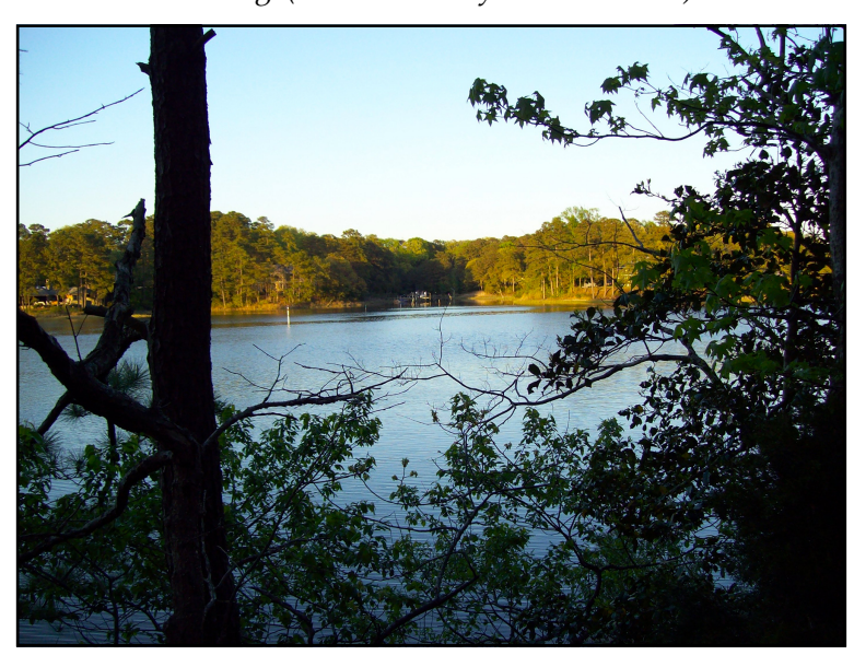
More places to see at the October Annual Meeting: The plant life has overwhelmed what remains of the nearly forgotten communities at False Cape, left. Hebden Cove on the Lynnhaven River, above, provides plenty of natural beauty.