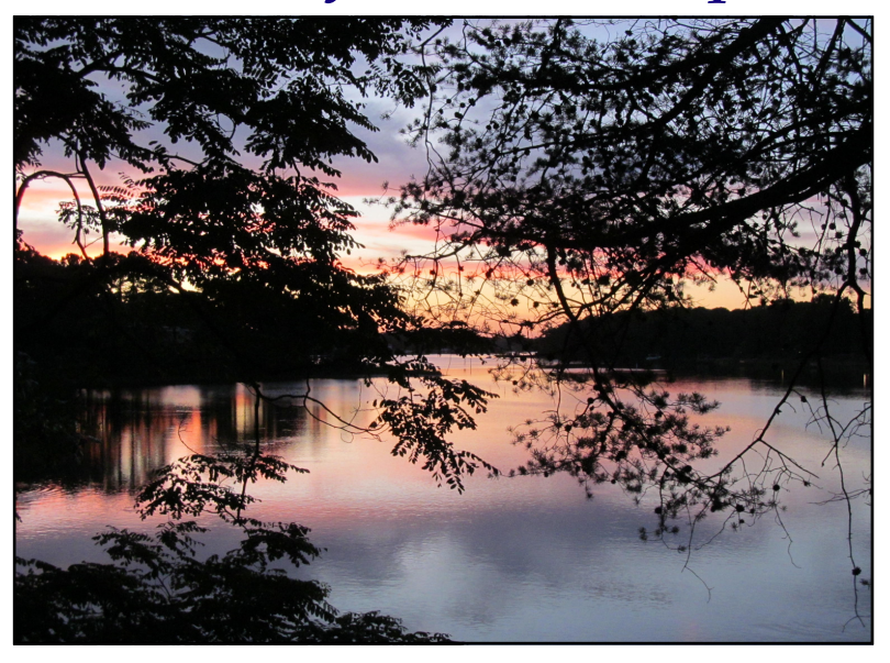
Sunset on the Lynnhaven River, the site for one of the field trips at the Annual Meeting.