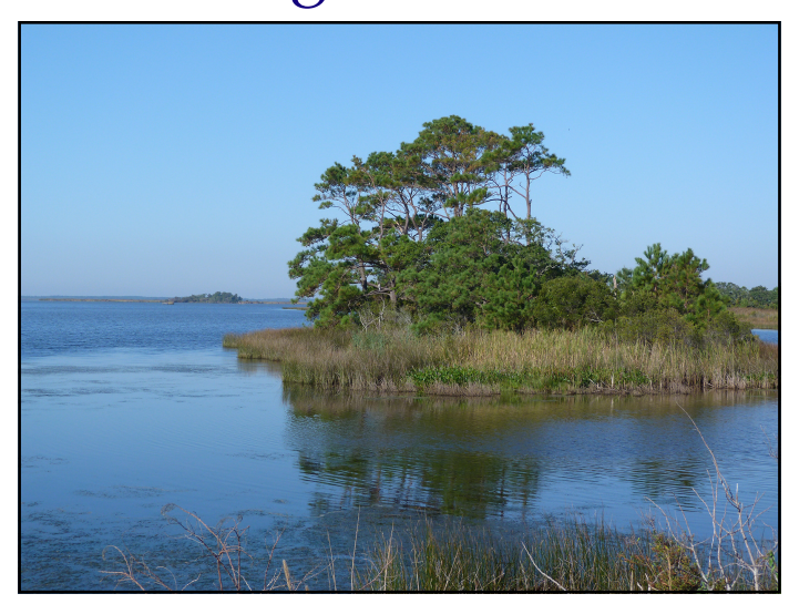
Those attending the Annual Meeting will have two opportunities for an all-day visit to False Cape State Park.