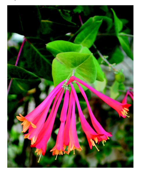
VNPS 2014 Wildflower of the Year Coral Honeysuckle

But it takes more than a hormonal signal to make a new root: living cells need to receive the signal and then respond to it. In honeysuckles, it is parenchyma cells of the leaf gap that respond by initiation of root growth. Normally these would-be mature cells are no longer undergoing cell division, but another response to auxin is the reversion of these mature leaf gap parenchyma cells to a meristem-like state, producing a cluster of rapidly dividing cells that eventually self-organizes as a root apical meristem. In other plants there may be different locations for new root initial formation, but it is always near the stem's vascular tissue. Some commonly noted-locations include between the xylem and phloem of a vascular bundle, completely within the ph-