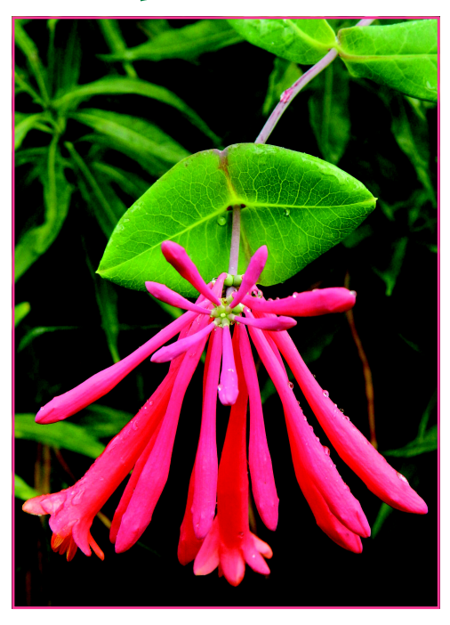
2014 Virginia Wildflower of the Year