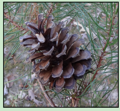
Shortleaf pine cone

An important timber species, the tree produces lumber for construction and millwork as well as plywood, barrels, boxes and crates. Seedlings and