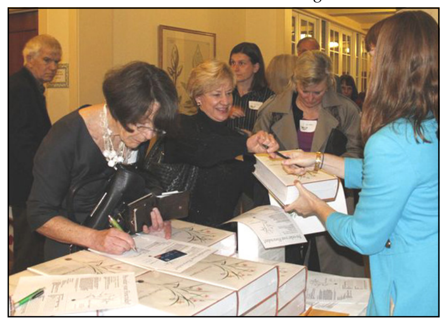
Like hotcakes: The Flora was selling hand over fist at all the December Premieres. Here, people buy copies at the Richmond party.