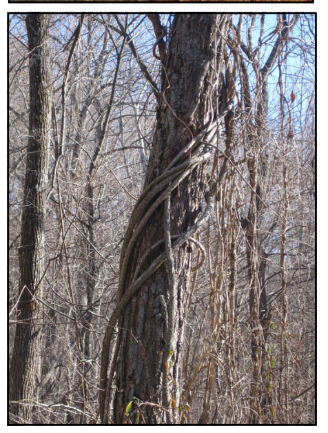
Top photo: Jack Hughes with Virginia Master Naturalist volunteers. Bottom photo: Oriental bittersweet strangling a tree.