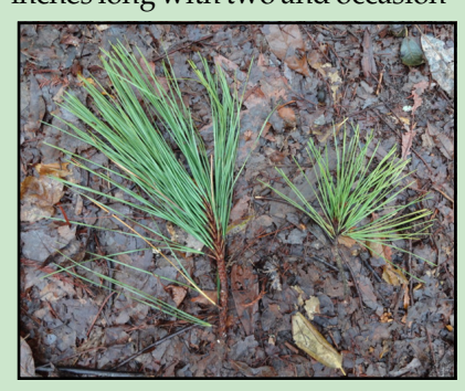
The longer needles of a loblolly pine, left, can be see in comparison to a shortleaf pine.

With some people suggesting loblolly pine, and others scrub pine as a favorite, shortleaf pine ( Pinus echinata ) is often overlooked. While less common around Williamsburg, it is the most widely distributed southern yellow pine, native in 12 southeastern states. This is a large, tall tree with a full, open crown. The trunk is straight, naturally pruned, the bark becoming reddish brown and breaking into broad, flat plates. Needles are two and a half to five inches long with two and occasion-