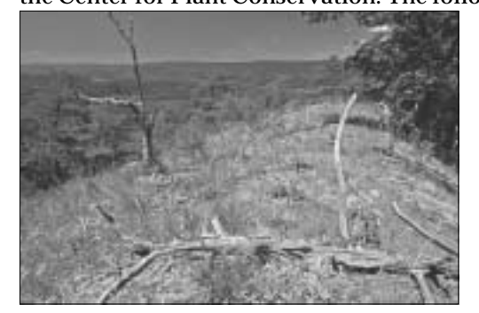
Plants such as shale barren rock cress have adapted to the harsh, unforgiving habitat of shale barrens such as the one pictured here.

The current VNPS fundraising will support sponsorship of the shale barren rock cress, Arabis serotina , with the Center for Plant Conservation. The following informa-