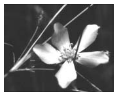
Sabatia is one of the prettiest dune/ swale plants. Sabatia stellaris is shown here with a common swale sedge, Fimbristylis castanea.

My colleagues and I ventured to the north end of Hog Island hoping to arrive at high tide so that we could unload the boat directly onto the Machipongo Station dock, named for the Nassawodoc Indian word for