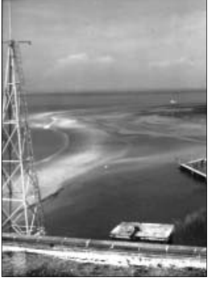
View atop Machipongo Station at the northwest corner of the island.

Behind the high saltmarsh are towering shrubs of the spicily scented wax-myrtle ( Morella cerifera ), the woody aster called groundsel tree