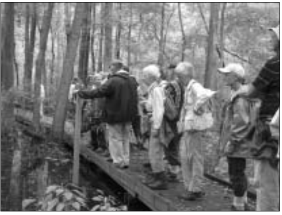
Trip participants cross a boardwalk over water at the New Kent Forestry Center, above. A sand dune at Savage Neck Dunes Natural Heritage Area is seen at top.