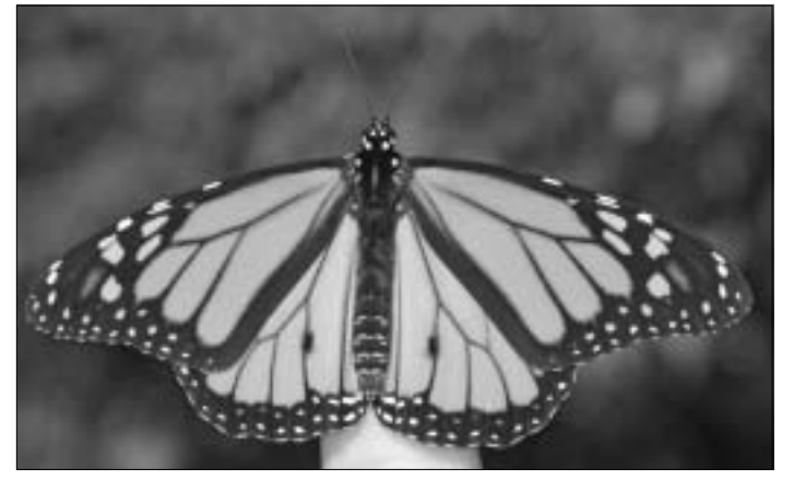
A beautiful male monarch readies for flight after drying his wings. The black spots on the hind wings indicate this is a male.

monarchs pushes its way from tiny gilded chrysalides with an agenda vastly different from its short-lived, frolicking, summer kin. These monarchs enter a phase called diapause, in which they postpone mating and reproduction until spring of the coming year and embarking instead on a genetically programmed six- to eightmonth mission to avoid the deadly cold of northern winter.