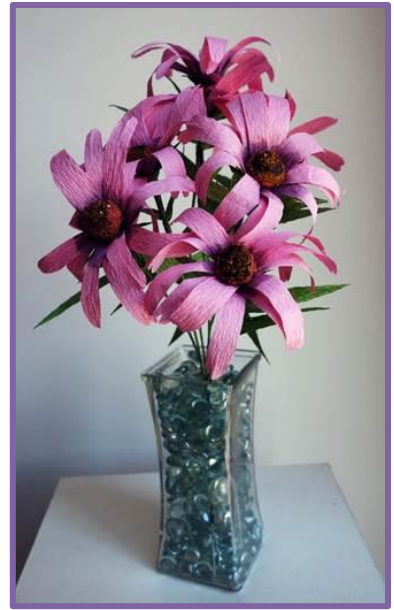
Purple Cone Flower Echinacea purpurea