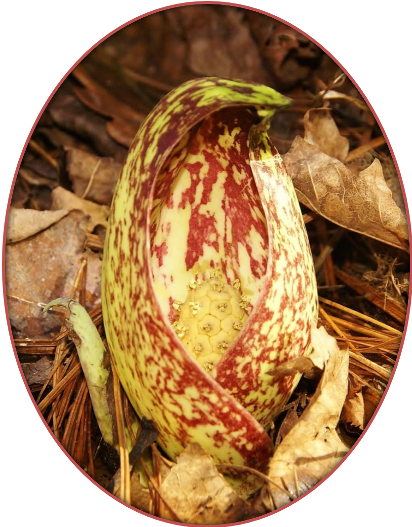
Skunk Cabbage, Symplocarpus foetidus