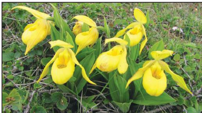
Yellow Lady's Slippers

We have many knowledgeable and talented folks in our group.