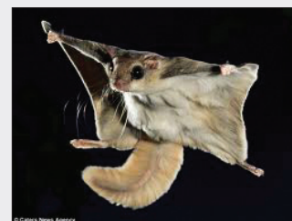
Flying squirrel Glaucomys sabrinus fuscus