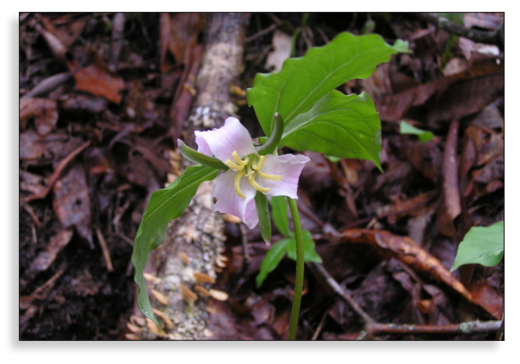
A large flowered trillium in blushing pink.