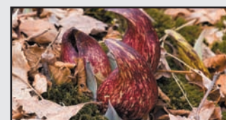
Skunk cabbage Symplocarpus foetidus

This walk will be an easy stroll along Trout Creek in Catawba. Learn how to identify trees in winter. We will show folks how to use a very simple twig key (See story page 7). Also we will take a look at skunk cabbage with a little folklore thrown in. The group will culminate the days activities with an early supper at the Homeplace Restaurant.