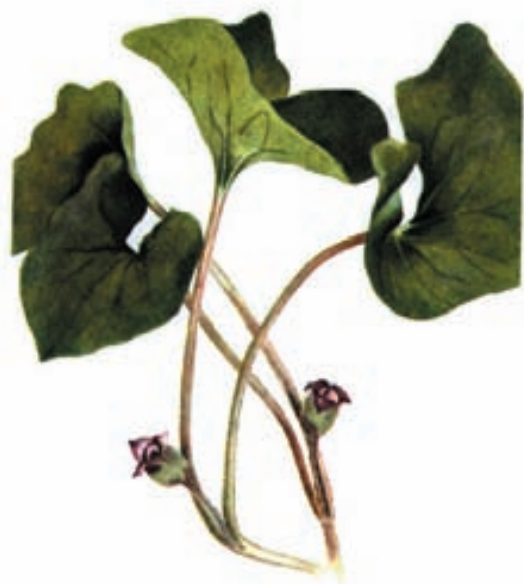
Wild Ginger Asarum canadense Learn more about the plant, Page 8