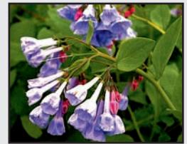
Virginia bluebells Mertensia virginica