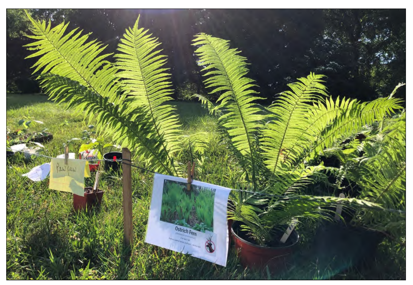
Ostrich, Lady, Christmas and Maidenhair ferns were popular purchases