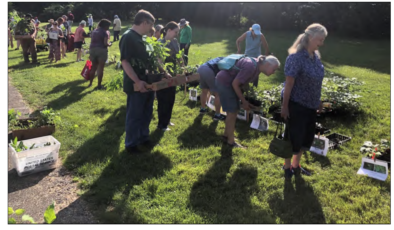
Each year, the early birds have their pick of the native plants

More than 30 volunteers helped the day of the sale. Our club members set out plants, answered questions, tallied purchases, collected money and conducted a raffle. The day started about 7 a.m. and lasted until the last of the cleanup at 2 p.m.