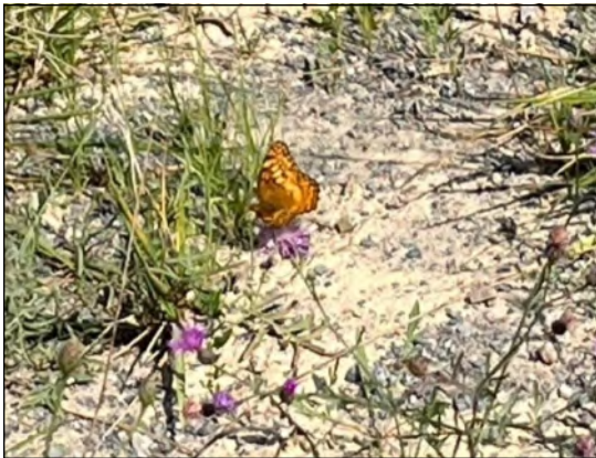
Great Spangled Fritillary