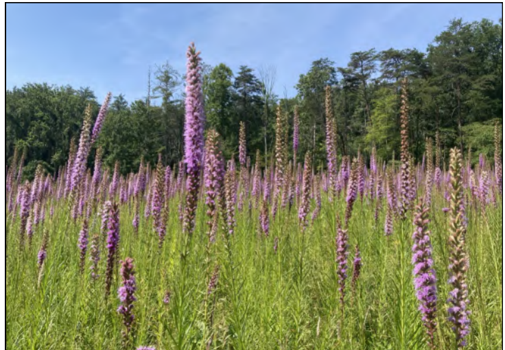
Liatris attracted lots of butterflies