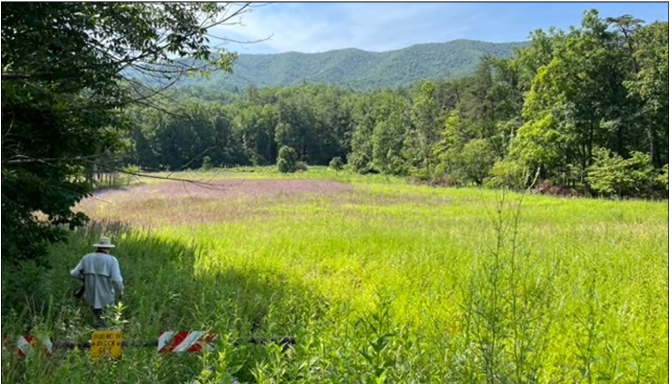
The Liatris field along Craig Creek Road near Blacksburg