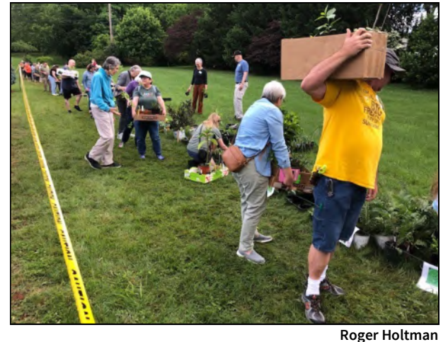
Plant sale Continued from Page 1

plantings, and that is the real value of our sale. We made that happen.