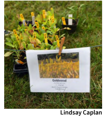
Goldenrod proved to be a popular seller

to sunset for 16 to 18 days until the babies fledge. The two adults collect 6,000 to 9,000 caterpillars for a single brood and those moth and butterfly caterpillars can only survive by feeding on native plants. Each of the goldenrods that we sold potentially serves as a host plant for 115 species of native caterpillars. Asters support 112 species, sunflowers 73 species and Joe-pye weed 42 species. Even on the lower end, the often-overlooked violets support 29 species, wild geraniums 23 species, black-eyed Susans support 20 species, and beebalm 12 species. Try to apply those numbers to 1,000 specimens we sold and the math soon becomes mind-boggling. In addition, the plants provide adult butterflies and moths with an ex-