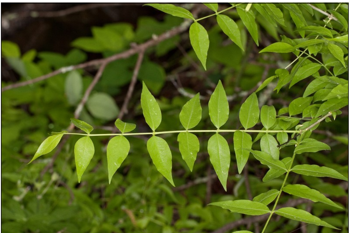
The leaves are opposite, pale green

The name "Pirate Bush" owes to the fact that Pirate Bush parasitizes an array of other plants, particularly Eastern Hemlock, which it loves . As a hemiparasitic plant, Pirate